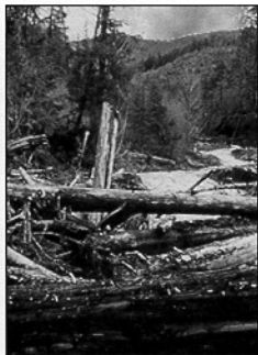
A Intermittent streams play a crucial role in bringing large wood into streams, where it helps create the complex habitat preferred by salmonids.

Human activities are creating a new disturbance regime... a "press" versus a "pulse" disturbance of natural systems.