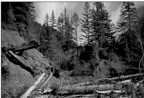
A Landslides and debris flows bring a combination of large woody debris and sediment into streams. Under natural disturbance regimes, streams and fish recover and benefit over time from these pulses of material.

Indeed, closer inspection by Reeves and others, the fish had a great deal to tell us about how they view "natural catastrophe."