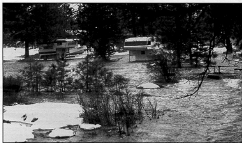
A Flooding is expected to increase in many areas under most climate change scenarios, and has already drawn the attention of insurance companies in the United States, where disaster payouts have increased over the last decade.

Conversation overheard at a water fountain: