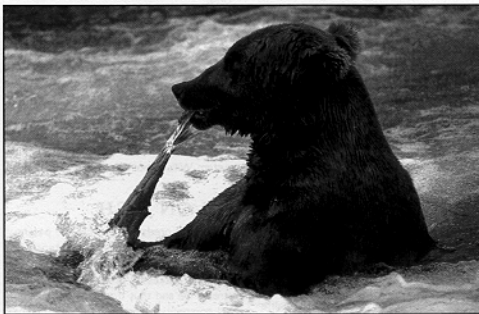
A Bears store up as much body fat as possible before going into hibernation, and can consume more than 40 pounds of food per day. Females will draw on their fat stores while nursing their young.

Migratory birds also vote by the numbers: May sees many thousands of Thayer's gulls pausing during their migration to breeding grounds in the Canadian Arctic to feast on spawning eulachon. Migrating red-breasted mergansers throng the river mouths to harvest the same plentiful food.