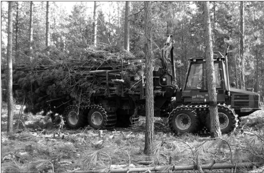
Strategically placed fuel-reduction treatments may produce merchantable and nonmerchantable timber. Finding ways to use nonmerchantable timber in some areas may help offset the costs of fuel treatments for other areas.

“Where such forest lands have been protected from fire, as they are very largely through the progress of settlement, young trees have usually sprung up in great numbers under or between the scattered veterans which had survived the fires...”