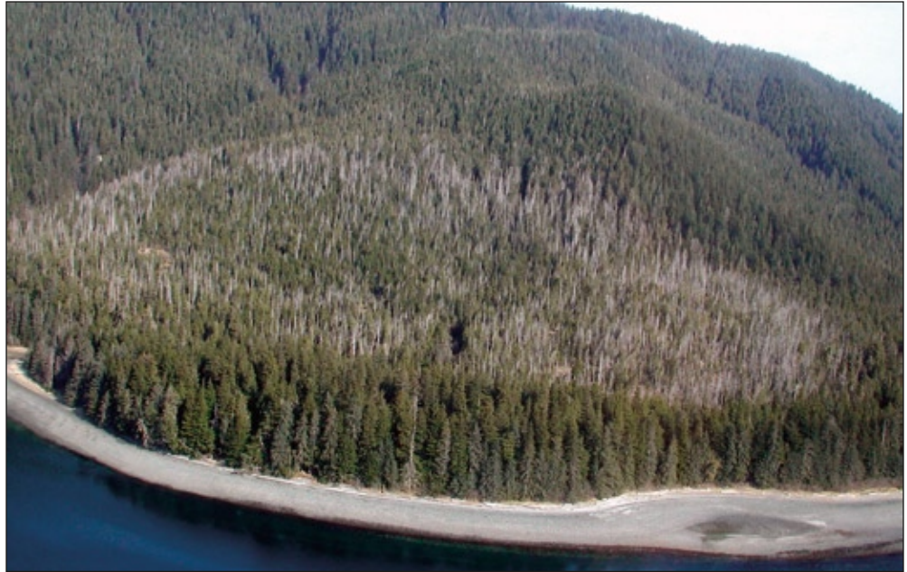
Figure 1—A large patch of yellow-cedar in decline near sea level close to the northern limits of the decline on Chichagof Island, Alaska.

years ago (Hennon and Shaw 1997). Following death, slow deterioration owing to yellow-cedar's unique heartwood chemistry (Barton 1976) allows snags to remain standing for up to a century. As these standing dead trees accumulate, 70 percent or more of yellow-cedar basal area is typically found dead in these forests. Thus, where mortality is this intensive, the problem is not difficult to detect by reconnaissance flights or other types of remote sensing.