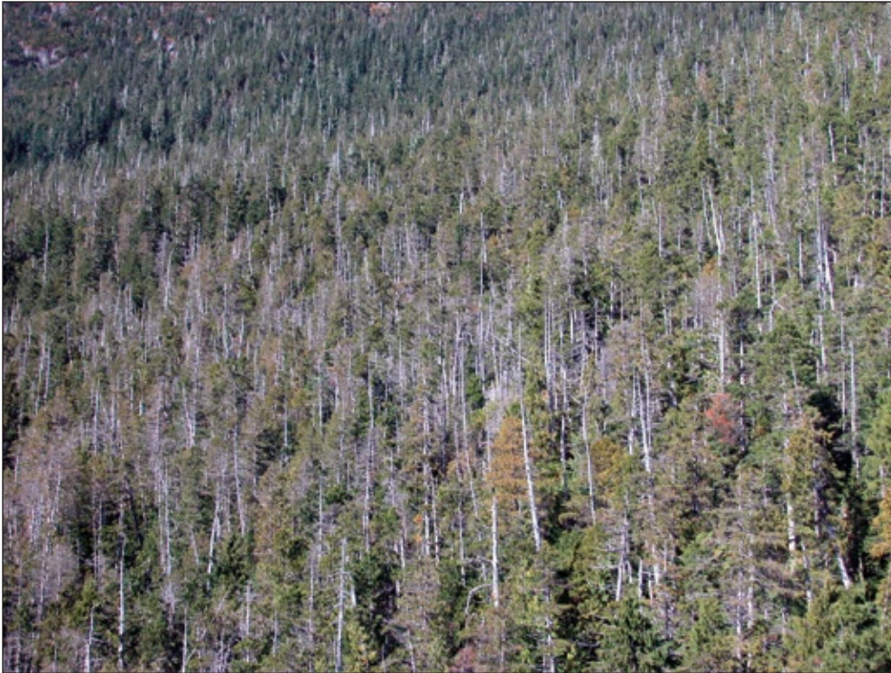
Figure 8—Union Inlet. Extensive, more diffuse yellow-cedar decline on a concave hillslope at approximately 300 m elevation that covered hundreds of hectares (much of the area beyond the photograph).