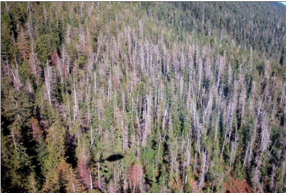
Figure 6—Crow Lagoon. This dense patch of snags illustrates the typical appearance of yellow-cedar decline: a mixture of older mortality, recently killed trees, and some dying trees. An estimated 70 to 80 percent of the overstory yellow-cedar trees was dead in this stand. This declining yellow-cedar forest was located above an open sloping bog on an east-southeast aspect at about 300 m elevation.