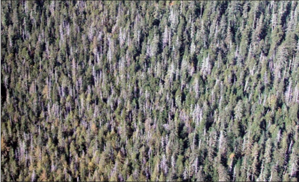
Figure 5—Scattered dead and dead-topped trees in a mixed western redcedar–yellow-cedar–western hemlock forested landscape at low elevation near Prince Rupert. Location is not shown on the map in figure 3. The abundance of spike-top, partially dead western redcedar confounds the identification of yellow-cedar decline in these mixed-cedar forests. The wood of both yellow-cedar and western redcedar is resistant to decay, and the slow deterioration of both tree species often leaves tree tops intact long after death. Thus, ground surveys would probably be needed to determine the live and dead populations of each species before judging whether forests such as this have a yellow-cedar decline problem.