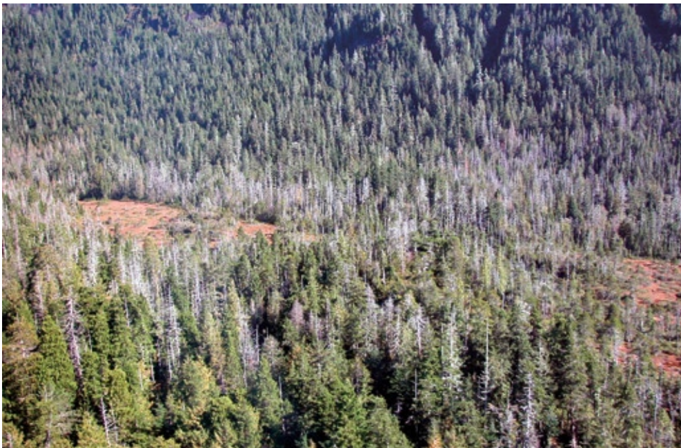
Figure 9—Union Inlet. A high concentration of dead yellow-cedar trees on gentle terrain surrounding bogs.