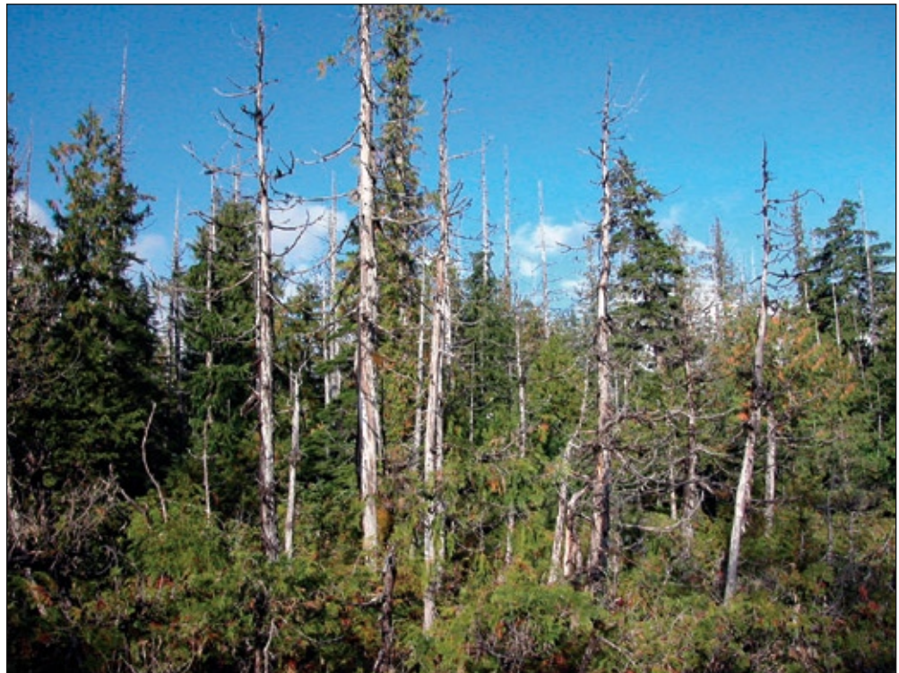
Figure 4—Diana Lake. Small patch of dead trees of both cedar species at a low-elevation bog woodland–bog forest complex. Generally, yellow-cedar occurs only as a minor component in low-elevation forests in areas such as Diana Lake. Large concentrations of dead trees were not found at this site.

Several other locations of dead trees were detected but photographs are not included in this report. Mortality was observed in a wet forested bog complex near Tuck Inlet. Scattered dead trees were noted at low elevation on the east side of Kennedy Island. At Captain Cove, relatively low concentrations of dead trees were observed on a hillside with south aspect at about 300 m. Two large bowls nearby at about 400 m elevation contained new and old yellow-cedar snags. One small patch with a concentration of dead cedars was observed on an exposed ridge. Concentrated mortality was detected on the north side of Holmes Lake on Pitt Island at about 350 m elevation, some of which was on steep terrain. A very large area of scattered snags could be seen extending at lower elevations along Petrel Channel on Pitt Island from Holmes Lake to Hevenor Inlet.