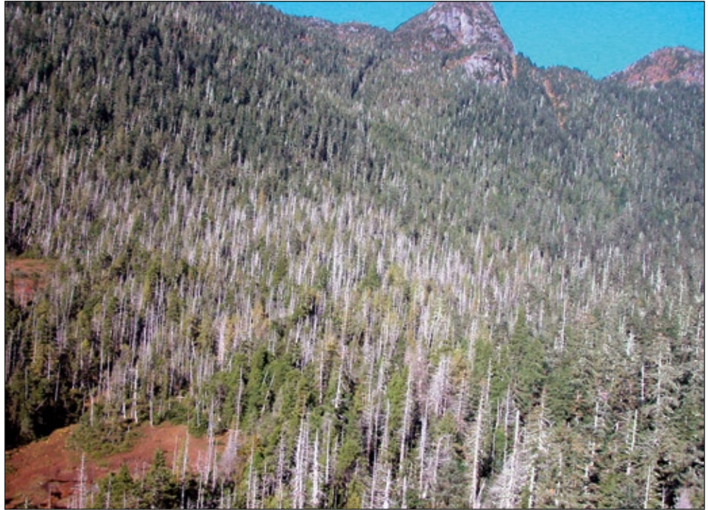
Figure 10—Worsfold Bay. Concentrated yellow-cedar mortality adjacent to a sloping bog in a cirque basin at 250 m elevation near Worsfold Bay. The appearance of large dead yellow-cedar trees with intact tops allows for simple detection of yellow-cedar decline.