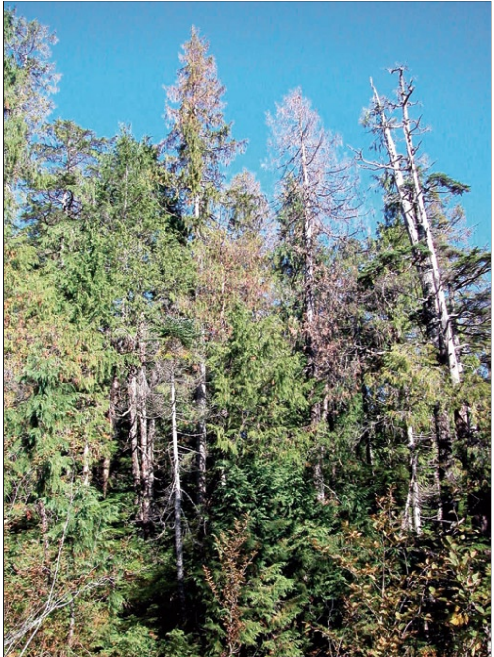
Figure 7—Crow Lagoon. Several dead and dying overstory trees, as well as smaller surviving yellow-cedar trees. Nearly all of the dead and dying trees encountered during this brief ground survey were yellow-cedar. Western redcedar contributed a small percentage of the stand and was not dying in high numbers. Necrotic lesions in the cambium extending up from the root collar, a symptom of yellow-cedar decline, were found on several dying yellow-cedar trees here.