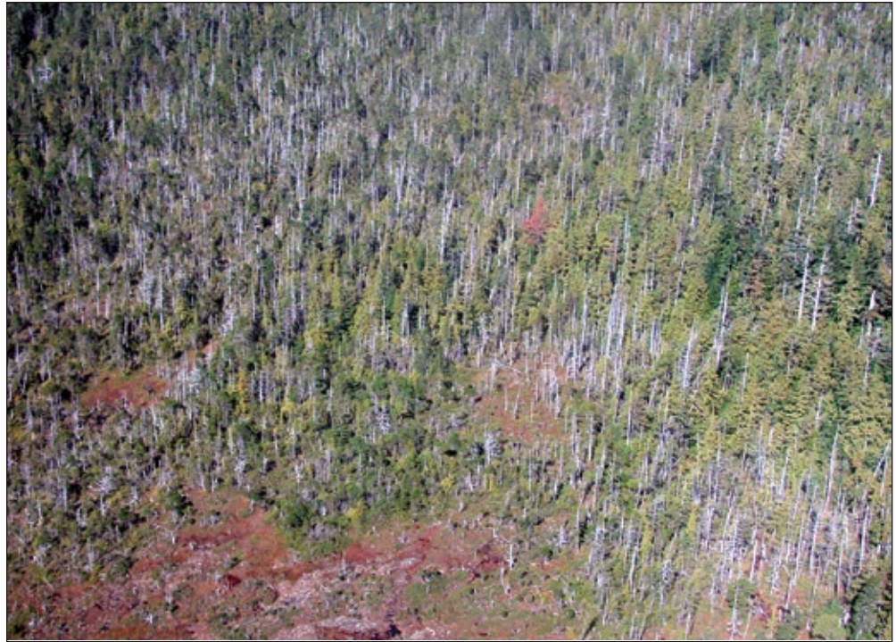
Figure 14—Cypress Lake, Banks Island. Dead trees associated with the edges of a bog depression. We observed large areas of mortality in a mosaic of scattered dead trees and higher concentrations from Donaldson Lake to north of Cypress Lake at various elevations and aspects. The more concentrated mortality had large dead trees and occurred on steeper slopes with greater forest productivity. We landed on a boggy hillside north of Cypress Lake at about 300 m elevation. Here, we found new and old snags, nearly all yellow-cedar. Most of the western redcedar was live, although some had spike tops. All trees were relatively small at this wet site.