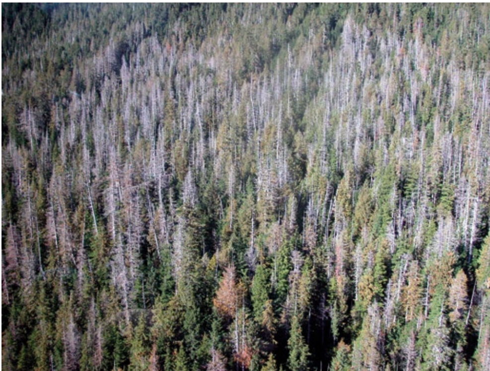
Figure 13—A closer view of the patch of yellow-cedar decline near Hayward Creek. Note the dying orange-crowned yellow-cedar trees interspersed with the dead yellow-cedar snags. This illustrates the progressive intensification of this forest decline.