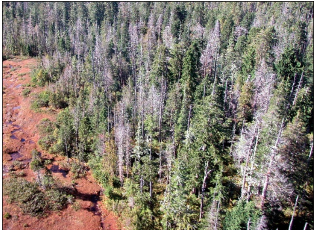
Figure 11—Worsfold Bay. Concentrated yellow-cedar mortality adjacent to a bog. The fine branches on some dead trees in the foreground indicate recent tree death.