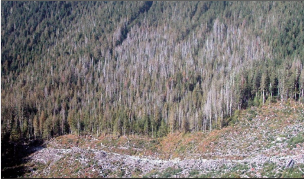
Figure 12—A concentrated patch of large yellow-cedar snags at about 300 m on a hillside above a cutting unit near Hayward Creek. Another patch of dead yellow-cedar (not shown) was found nearby at about 400 m elevation.