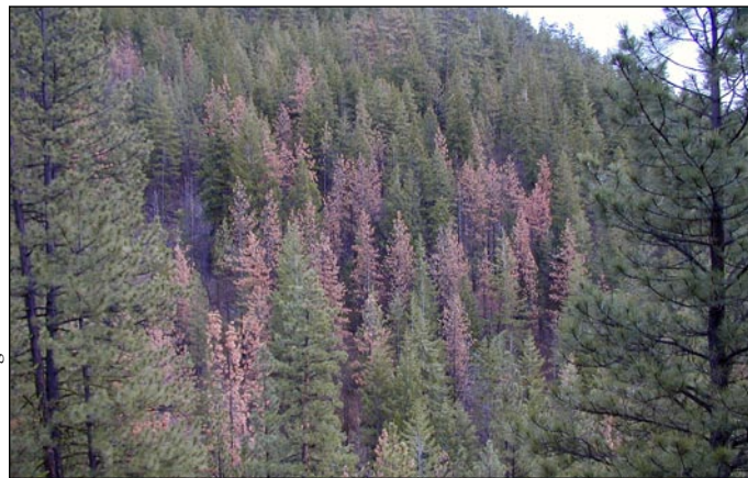
Tree-killing insects such as western pine beetle spread easily through widespread, densely stocked dry forest. The forest continuity is markedly different from the mosaic pattern historically found in dry forest in fire-prone provinces.

The abundance of natural fire refugia was highly variable across the dry provinces. For example, one study in the Wenatchee Mountains found that less than 20 percent of the presettlement landscape was historical fire refugia. Another study found that LSOF patches in the eastern Cascade Range historically ranged from 3 to about 39 percent of any given area.