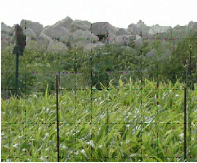
Figure 5. First corn crop during 2002 growing season

PCBs. None of the treatments produced a final mean concentration of total PCBs below this standard. This holds true for both aroclor and congener-based results (Table 5).