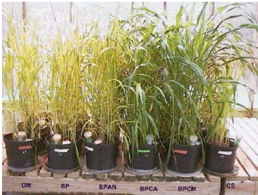
Figure 4. ERDC greenhouse soil/amendment experimentation

naturally on the CDF, the ones used in this field demonstration will be harvested ultimately. The accumulated biomass may be chipped and disposed of or recycled for landscaping purposes offsite.