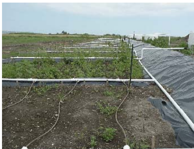
Figure 2. Layout of treatment plots at Jones Island CDF

A biomound study conducted by the USACE Detroit District in 1998 at the Jones Island CDF concluded that there were indigenous microorganisms within the dredged material capable of degrading PAH and PCB compounds. During 2000 the ERDC conducted a series of greenhouse trials to evaluate