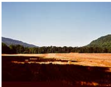
RETAINED: (Left) Looking south from McDade Trail. The south end of Mosier's Knob PA is on the right.