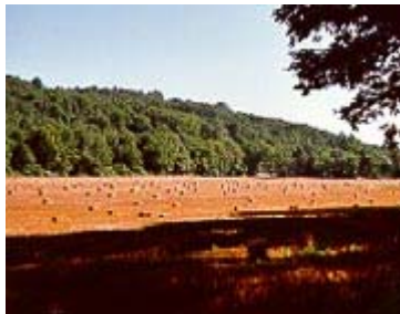
RETAINED: (Left) Looking north from McDade Trail toward the north end of Mosier's Knob PA.