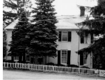
(Above) BURNED: Theune farmhouse, River Road, in 1967.

Theune farmhouse once stood on the east side of River Road near Zion Church. Ironically, the dairy's prosperity and the resultant modernization of this comfortable home and its farm buildings caused them to be judged of "little historic value".