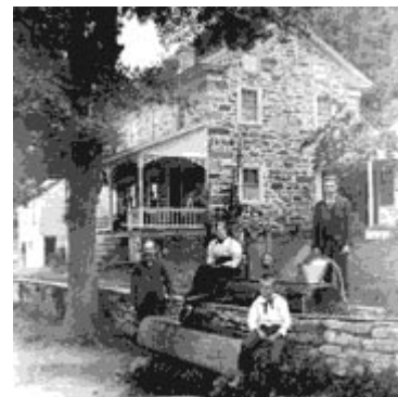
BURNED: Kautz farmhouse around 1900.

This is a fitting location for this major recreational facility to start. Farms and settlements existed here long before the recreation area was established, and their fate is part of the park's story. The federal project that created the park, the proposed Tocks