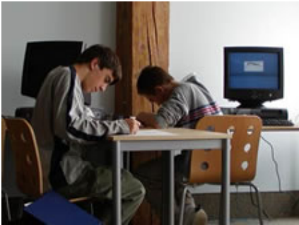
Individual areas or "cave spaces" available throughout the school

In 2002, a former 19 th century plumbing-supply warehouse became the new home of Duluth, Minnesota's Harbor City International School . A small group of dedicated teachers worked closely with educational facility planners and architects to find an urban building with the potential to meet their educational philosophy: to provide a high degree of attention to the individual needs of high school students, combined with opportunities to exhibit their knowledge and achievements. Starting on the building's third floor and with about 14,000 square feet of space, the Harbor City team fashioned a combination of innovative learning environments: intimate "cave" spaces; variable-sized rooms that lend themselves to explorations in academic subjects; get away spaces or niches; presentation space; spaces with access to food and beverage; and distinctive places to capture the project-based learning that is at core of the school's instructional approach. As expressed by Harbor City students on the