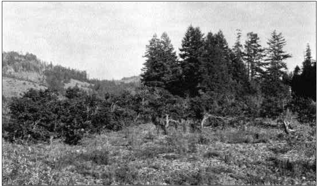
Figure 5—Scrubby Quercus/Cytisus/Agrostis community on stony and cobbly Riverwash soils contiguous to the Umbellularia-Pseudotsuga/Acer/Polystichum community.

Quercus garryana/Cytisus scoparius/Agrostis stolonifera community —A scrubby, subxeric, open-canopied woodland of Oregon white oak ( Quercus garryana ) and the naturalized noxious weed, Scot's broom ( Cytisus scoparius ), encompasses about 0.7 ha on a low flood-plain terrace at the western end of MIRNA (fig. 5). Riverwash and Camas-Newberg complex soils are the representative soil series in the Oregon white oak/Scot's broom community. This gnarled Oregon white oak stand has severe mechanical damage effects from fluvial debris conveyed and deposited during annual winter flooding. Oregon white oak has seedling, sapling, and pole-size trees with many saplings originating from stump and root collar sprouts. In a sample, 17 pole-sized trees were measured in the 20- to 40-cm d.b.h. size class.