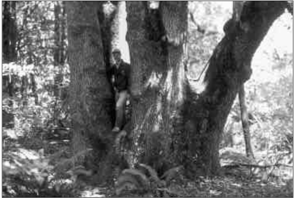
Figure 4—The largest Umbellularia californica at Myrtle Island Research Natural Area. Three boles measured 74, 117, and 154 cm.

is present in all size classes: seedlings, saplings, poles, mature, and relict. A relict three-boled California-laurel measured 74, 117, and 154 cm in diameter at breast height (d.b.h.) (fig. 4), and a two-boled tree measured 87 and 101 cm d.b.h. Among the random single-boled trees measured, 14 were in the 70- to 90-cm d.b.h. class. Franklin et al. (1972) report the largest California-laurel at MIRNA was 50 to 60 cm d.b.h. and 15 to 21 m tall.