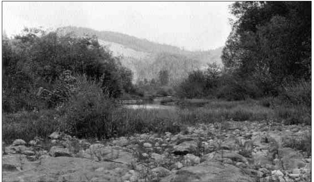
Figure 7—The seasonal pool community in Riverwash soils. The emergent and sedge-grass zones are well-developed. Alnus rubra stand is in the background.

American bugleweed ( Lycopus americanus ), autumn willow-weed ( Epilobium brachycarpum ), stream orchid ( Epipactis gigantea ), hooded ladies tresses ( Spiranthes romanzoffiana ), flatsedges ( Cyperus spp.), spikerushes ( Eleocharis spp.), and rushes ( Juncus spp.). Important exotic herbs of drier habitats are reed canary grass, white sweet clover, common St.-John's wort, redtop, tall fescue ( Festuca arundinacea ), orchard grass ( Dactylis glomerata ), and the native Canada goldenrod ( Solidago canadensis ssp. elongata ).