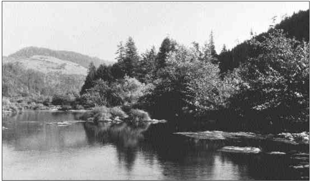
Figure 6—The Salix spp./ Equisetum community from the northern branch of the Umpqua River. Trees and shrubs include Salix lucida and Alnus rhombifolia with sedge tussocks of Carex nudata on exposed sandstone bedrock.

Salix spp./ Equisetum arvense community —The shrubby willow ( Salix spp.)-dominated community is the first seral stage to become established at MIRNA. The mixed willow zone forms on the lowest flood-plain band along the southern, western, and northern 1.9 ha of MIRNA. This community is contiguous with the drier Oregon white oak stand at the western end and the more elevated red alder-Oregon ash stand on the northern end (fig. 6). Riverwash soils are the principal soil series in this community. The habitat ranges from very wet at the Umpqua River streambank to dry in exposed areas away from the water. This community is frequently flooded for indefinite periods during winter and spring.