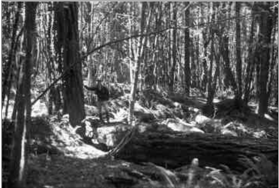
Figure 3—Sapling and pole-sized Umbellularia californica at the western portion of Myrtle Island Research Natural Area. Relict Pseudotsuga menziesii is in the background. Polystichum munitum forms a sparse ground cover.