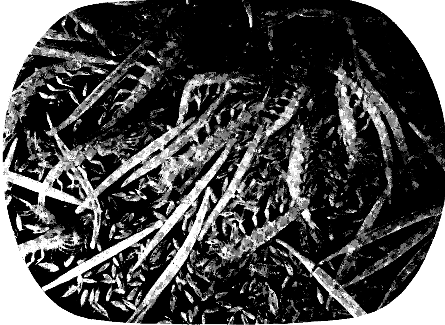
FIG. 14.—Plankton dominated by the pelagic shrimp Meganyctiphanes norvegica and by the glassworms Eukrohnia hamata and Sagitta elegans , with Calanus and other copepods. Northeast part of basin, March 23, 1920 (station 20081), haul from 140-0 meters. \times 1.25