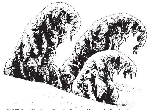
©1977 from Northwest Trees by Ramona Hammerly. Reprinted with permission of The Mountaineers Books, Seattle.