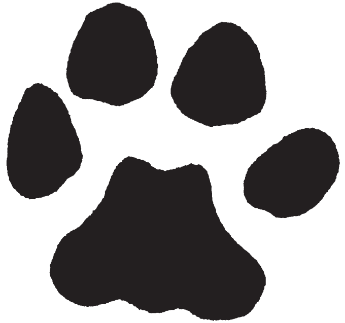
Life-sized cougar front paw track

The cougar, also called mountain lion, puma, or panther, once ranged across North America and from Canada to the tip of South America. Its scientific name, Felis concolor , means “cat of one color,” which is usually tawny gray or reddish-brown with black markings on the face, ears and tip of the tail. Young kittens have black spots. Adult males can be over eight feet long (including nearly three feet of tail! ) and can weigh over 150 pounds; females weigh about 90 to 110 pounds. An adult cougar’s front paw track is about 3½ inches across, with rear paw tracks slightly smaller.