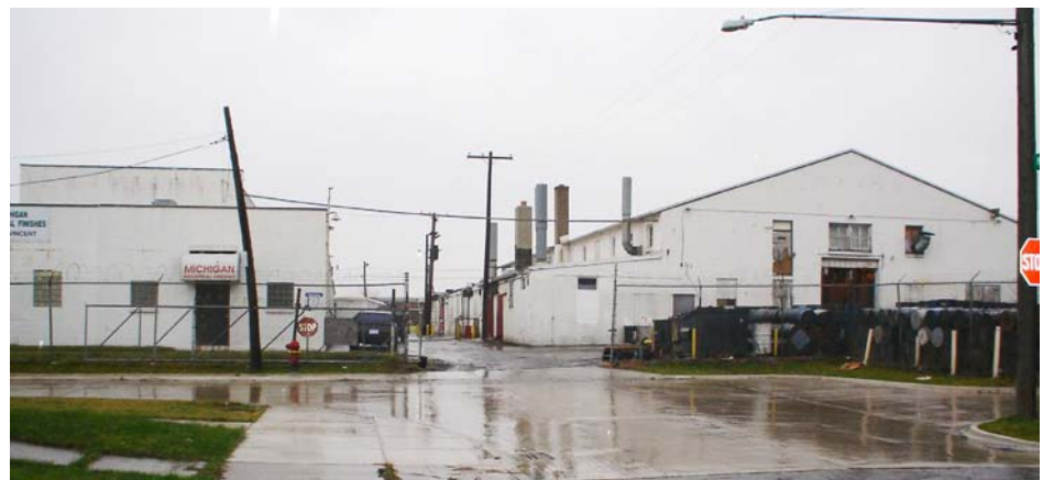
The Michigan Industrial Finishes cleanup is expected to be completed in about six months.