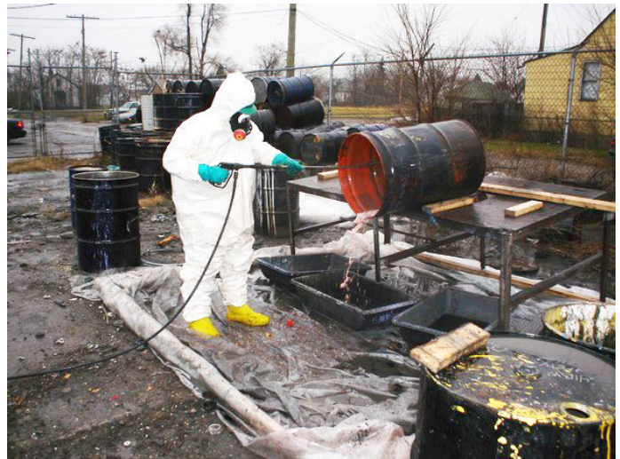
An EPA contractor rinses out a 55-gallon drum.

EPA will also remove and dispose of all soil that is visibly contaminated, and is planning to collect samples of the remaining soil to find out the extent of the soil contamination. Throughout the project, workers are monitoring the air to ensure that harmful vapors do not threaten area residents or workers.