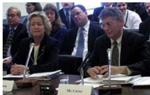
Testifying before the House Subcommittee on Select Education