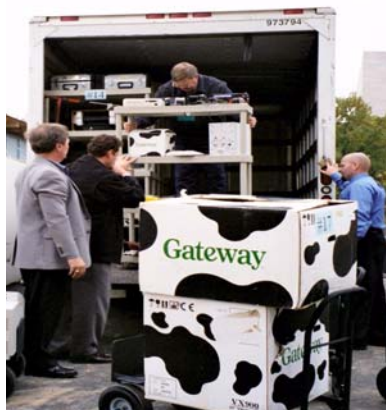
OIG Special Agents transport evidence to court

Our investigations resulted in a significant number of arrests, convictions, indictments, jail sentences, and monetary restitutions to the government for fraud against the Department's programs. The last three persons charged in a wide-ranging conspiracy to defraud the Department of over one million dollars in electronic equipment and false overtime charges were found guilty after a federal trial. Also, in a related matter, Verizon Federal Systems entered into a $2 million civil settlement with the Department for federal claims on false overtime charges and improper purchases by Verizon employees who conspired with the Department employees. To date, nineteen persons, including eight Department employees, have either pled guilty to federal charges or been convicted after a federal trial in this case, and fourteen have been sentenced.