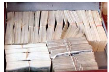
Cash seized by OIG Special Agents

As previously reported, an extensive joint OIG/FBI investigation involving fraudulent contracts for services under the Goals 2000 program and Technology Literacy Challenge Fund with the Puerto Rico Department of Education, resulted in a jail sentence and forfeiture order totaling over $800,000 for the President of RV Research and Management. As part of this investigation, the former Puerto Rico Secretary and Associate Secretary of Education were sentenced in December 2002 to 12 and 11 years respectively, for using their positions to extort $4.3 million from Puerto Rico Department of Education contractors.