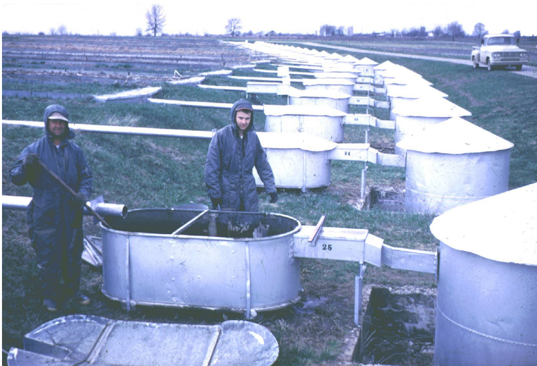
Figure 4. Technicians servicing runoff and erosion plots at McCredie, Missouri, during the 1950s. Runoff and sediment from the bottom of the plots (left) was transported through a pipe to an initial collection (sludge) tank. When runoff exceeded the capacity of the tank, flow exited through a rectangular channel (center, with number “25” on it) to a flow splitter. A fraction of this outflow was then collected in the second (aliquot) tank.

The transfer of research information to producers and conservationists was an integral part of the mission of the SCES. Visitors to the stations were informed of the need for erosion control, the factors causing soil loss, and the application of various methods to control erosion.