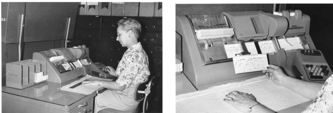
Figure 5. One of the statistical clerks (left) at the National Runoff and Soil Loss Data Center transferring information onto computer punch cards (right) during the 1950s.

The successful accomplishments of employees at the NRSLDC supported efforts in the 1970s to gain congressional