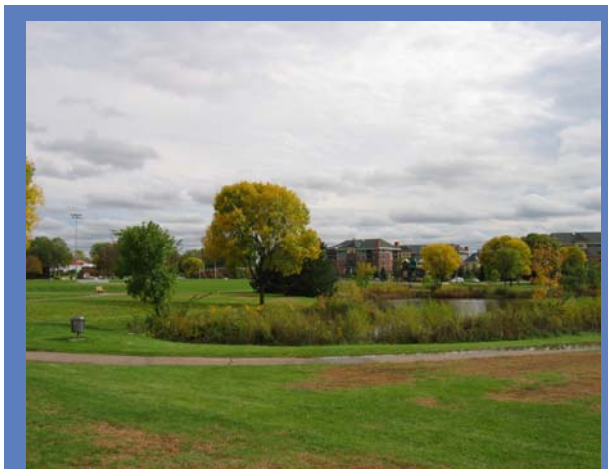
Once contaminated with coal tar and creosote, the Reilly Tar & Chemical site in St. Louis Park, Minnesota now boasts a park, a residential development, and a pond that provides wildlife habitats.

EPA recommends that prospective purchasers contact the appropriate EPA Regional office prior to purchase of a Superfund site to discuss the cleanup status of the site and other site-related issues. EPA Regional Superfund Redevelopment Initiative contact information is available on EPA's Superfund Web site at http://www.epa.gov/superfund/programs/recycle/contact/redevelopment.html . In addition, EPA strongly encourages prospective purchasers to contact the state environmental protection agency where the site is located to discuss potential state issues such as liability and additional cleanup.