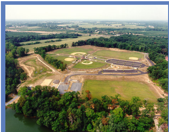
Alcyon Lake in Pitman, New Jersey, had been severely contaminated by the nearby Lipari Landfill. EPA teamed with the state, local government, and community to develop a cleanup plan that allowed for the expansion of the park and accelerated cleanup of the lake.

EPA is willing to work with prospective purchasers to clarify a property's cleanup status and potential liability issues including the existence and satisfaction of EPA liens and property use restrictions. States also have cleanup programs and prospective purchasers should contact the appropriate state environmental agency to make certain they are aware of planned or ongoing state-lead cleanup actions at the property.