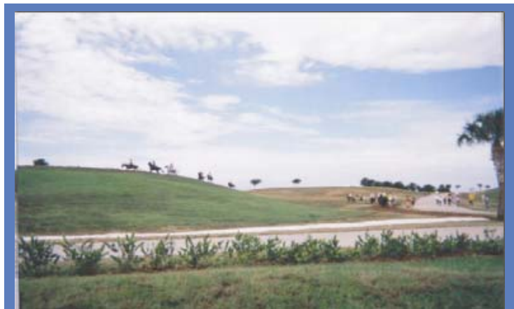
Davie Landfill in Broward County, Florida has been redeveloped into Vista View Park, which includes walking, horseback riding, and bike trails; a picnic area; and a catch-and-release fishing pond.

EPA encourages BFPPs to inquire about property restrictions before they purchase the site. Prospective purchasers can find out whether any use restrictions may apply to the site property now, or in the future, by contacting EPA's Regional office, the state environmental agency and/or the local government, and by talking to the current property owner. If a BFPP purchases a site before EPA has made a final cleanup decision, EPA may be unable to predict what property use restrictions may need to be implemented in the future. Prospective purchasers can also find out information on use restrictions in effect by performing all appropriate inquiries. (See Question 4 for more information on all appropriate inquiries.)