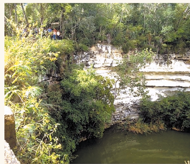
Cenote at Chichén Itzá, Mexico

The low-lying Yucatan Peninsula of eastern Mexico is covered by a blanket of limestone, and dissolution of the limestone by infiltrating rainwater has created a highly permeable aquifer, comparable to the Floridan aquifer of the Florida peninsula. Infiltration of rainwater is so rapid that there are no surface streams. For millennia, human civilizations relied on sinkholes formed by collapse of rock above subsurface cavities—locally known as cenotes—for water supply. Great troves of Mayan relics have been found in some cenotes.