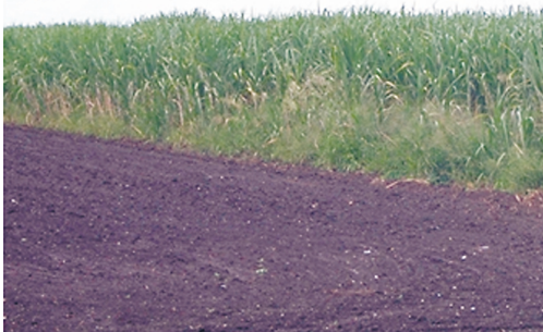
The organic soils of the Florida Everglades are quickly disappearing.

The five case studies demonstrate how agricultural and municipal-industrial ground-water use have combined to deplete critical ground-water resources and create costly regional-scale subsidence. We begin in the “Silicon Valley” in northern California, where early agricultural ground-water use contributed to subsidence that has increased flood risks in the greater San Jose area. Silicon Valley (properly the Santa Clara Valley) was the first place in the United States where subsidence due to ground-water pumpage was recognized; since the late 1960s, the ground-water resource there has been successfully managed to halt subsidence. In nearby San Joaquin Valley, the single largest human alteration of the Earth’s surface topography resulted from excessive ground-water pumpage to sustain an exceptionally productive agriculture. In the Houston-Galveston area in Texas, early production of oil and gas, and a long history of ground-water pumpage, have created severe and costly coastal-flooding hazards and affected a critical environmental resource—the Galveston Bay estuary. In Las Vegas Valley ground-water depletion and subsidence have accompanied the conversion of a desert oasis into a thirsty and fast-growing metropolis. Finally, in south-central Arizona, importation of Colorado River water and conversion of water-intensive agriculture to lower-water-demand urban land uses has helped to partly arrest subsidence and forestall further fissuring of the Earth’s surface.