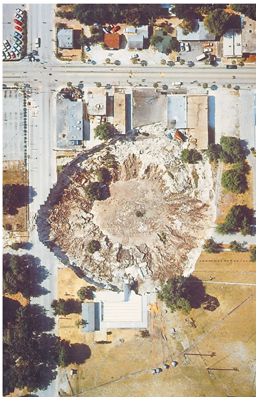
Cover collapse sinkhole in Winter Park, Florida, 1981

Evaporite rocks underlie about 35 to 40 percent of the United States, although in many areas at depths so great as to have no discernible effect at land surface. Natural solution-related subsidence has occurred in each of the major salt basins (Ege, 1984) throughout the United States. The high solubilities of salt and gypsum permit cavities to form in days to years, whereas cavity formation in carbonate bedrock is a very slow process that generally occurs over centuries to millennia. The slow dissolution of carbonate rocks favors the stability and persistence of the distinctively weathered landforms known as karst. Carbonate karst landscapes comprise more than 40 percent