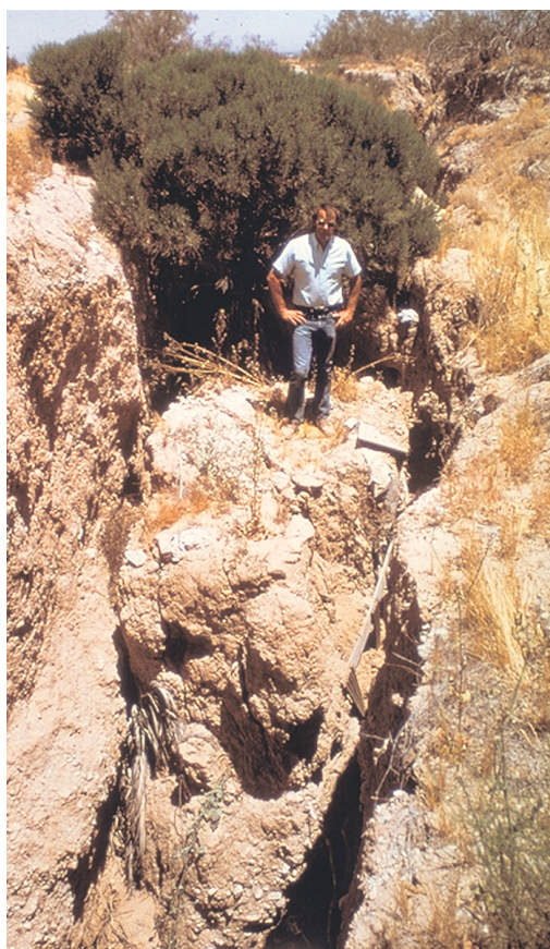
This earth fissure formed as a result of differential compaction of the aquifer system near Mesa, Arizona.

Land subsidence is a gradual settling or sudden sinking of the Earth's surface owing to subsurface movement of earth materials. Subsidence is a global problem and, in the United States, more than 17,000 square miles in 45 States, an area roughly the size of New Hampshire and Vermont combined, have been directly affected by subsidence. The principal causes are aquifer-system compaction, drainage of organic soils, underground mining, hydrocompaction, natural compaction, sinkholes, and thawing permafrost (National Research Council, 1991). More than 80 percent of the identified subsidence in the Nation is a consequence of our exploitation of underground water, and the increasing development of land and water resources threatens to exacerbate existing land-subsidence problems and initiate new ones. In many areas of the arid Southwest, and in more humid areas underlain by soluble rocks such as limestone, gypsum, or salt, land subsidence is an often-overlooked environmental consequence of our land- and water-use practices.