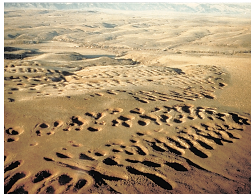
Subsidence pits and troughs formed above the Dietz coal mines near Sheridan, Wyoming. The coal mines were in operation from the 1890s to the 1920s.