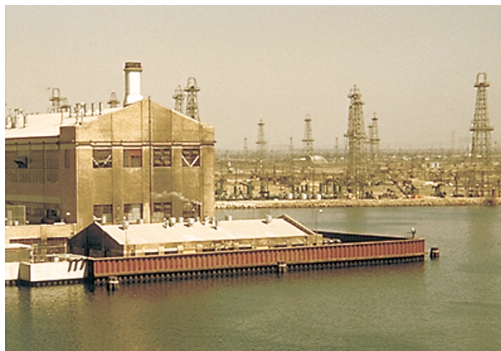
Oil and gas removal in Long Beach, California caused subsidence. Levees were built to prevent flooding of the oil fields and port facilities.

Several other types of subsidence involve processes more or less similar to the three mechanisms just cited, but are not covered in detail in this Circular. These include the consolidation of sedimentary deposits on geologic time scales; subsidence associated with tectonism; the compaction of sediments due to the removal of oil and gas reserves; subsidence of thawing permafrost; and the collapse of underground mines. Underground mining for coal accounts for most of the mining-related subsidence in the United States and has been thoroughly addressed through Federal and State programs prompted by the 1977 Surface Mining Control and Reclamation Act. No such nationally integrated approach has been implemented to deal with the remaining 80 percent of land subsidence associated with ground-water processes.