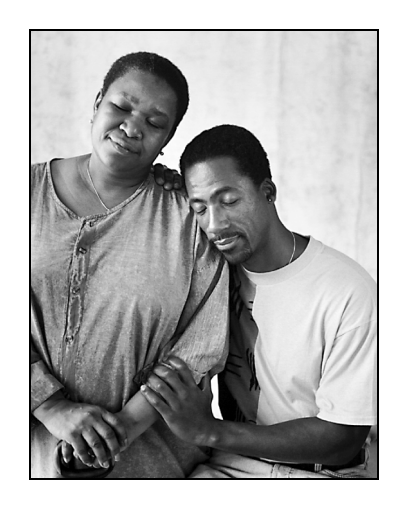
The estimated 200,000 people who experience chronic homelessness tend to have disabling health and behavioral health problems.

The estimated 200,000 people who experience chronic homelessness tend to have disabling health and behavioral health problems. Recent estimates suggest that at least 40 percent have substance use disorders, 25 percent have some form of physical disability or disabling health condition, and 20 percent have serious mental illnesses (Culhane, 2001). Often individuals have more than one of these conditions. These factors contribute not only to a person's risk for becoming homeless but also to the difficulty he or she experiences in overcoming it. People who experience chronic homelessness also tend to be slightly older than those who experience shorter homeless episodes, are non-white, and male (Culhane and Kuhn, 1998). Families and youth experience chronic homelessness, as well.