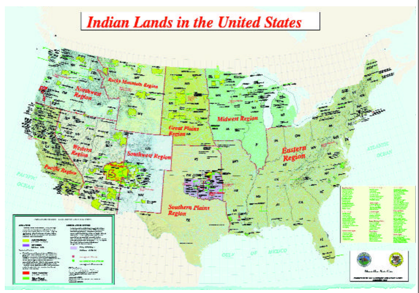
Figure 1: Map of Indian lands in the conterminous United States (BIA, 2000b). The largest areas are located in the central to western US.