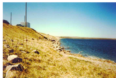
Box Butte (upstream face)

Definitions: A dam is a significant barrier across a stream to impound and/or divert water and has outlet works. A dike is a low embankment along the rim of a reservoir or stream to limit the extent of flooding and has no outlet.