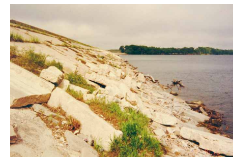
Minitare (upstream face)