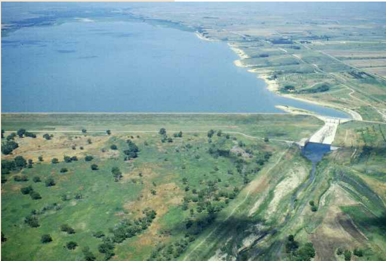
Trenton Dam and Swanson Reservoir.

The Wyoming Area Office is responsible for the North Platte Project which is provided water from reservoirs in Wyoming and the Nebraska-Kansas Area Office manages six other projects or units of the Pick-Sloan Missouri Basin Program.