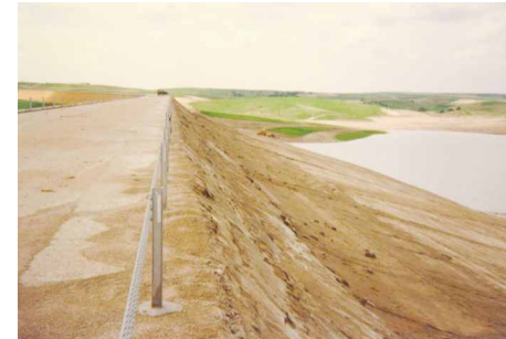
Davis Creek (upstream face)