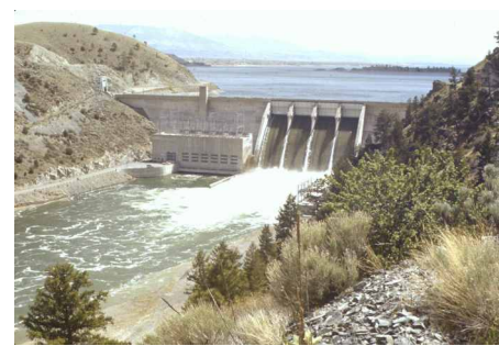
Canyon Ferry Dam & Powerplant