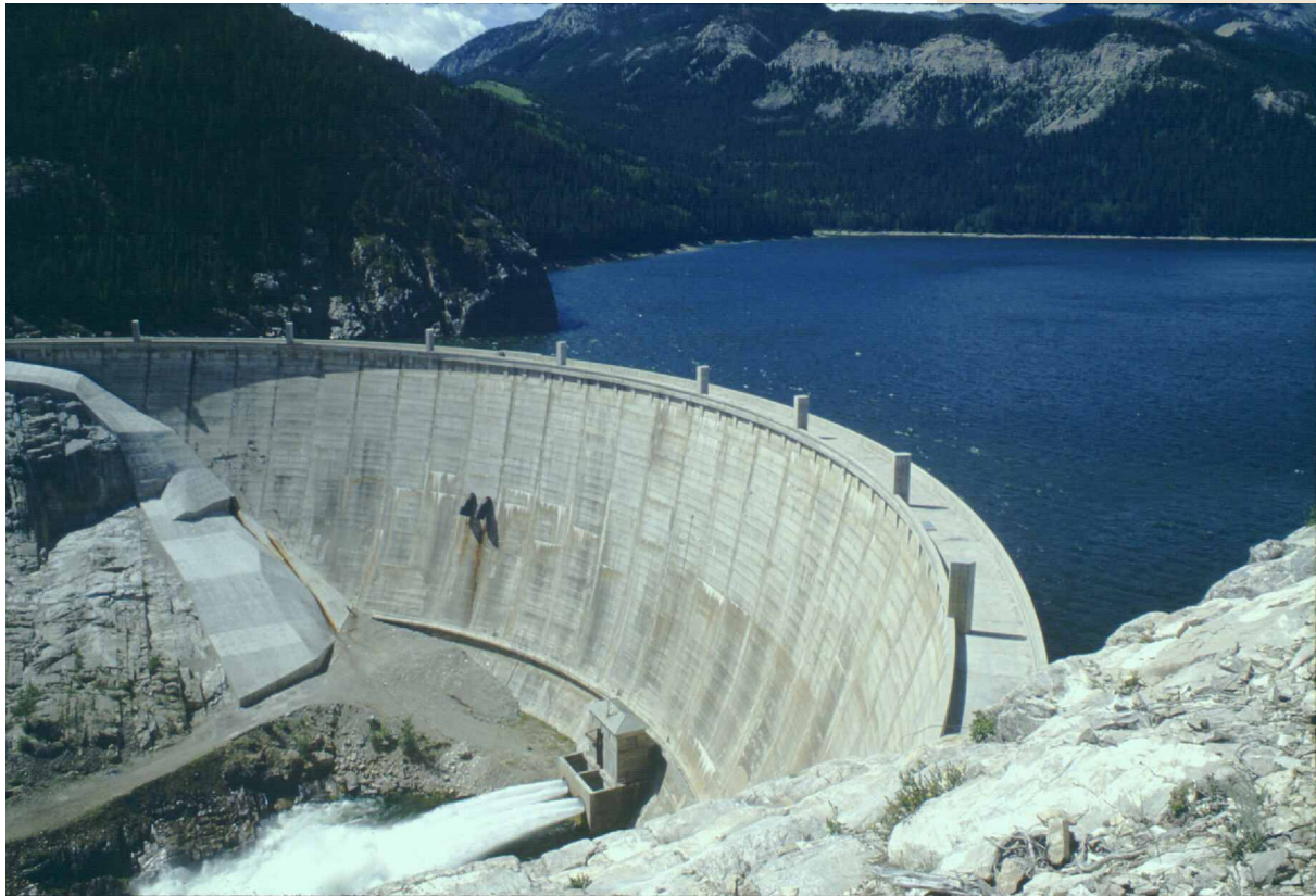
Gibson Dam west of Great Falls. The dam is the site of ongoing safety of dams work to improve foundation drainage.

Reclamation is also involved in the development of three rural water systems in Montana that will serve over 51,000 people when completed. The Fort Peck Rural County Rural Water System is complete and the Fort Peck Indian Reservation & Dry Prairie Rural Water System is under construction. A groundbreaking ceremony was conducted in August 2006 for the North Central/Rocky Boys Rural Water System and project construction started in September.