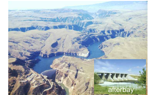
Yellowtail Dam & Powerplant