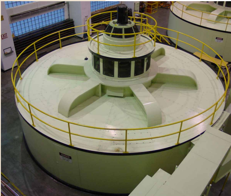
6900 volt generator number 1 at Canyon Ferry Powerplant, Montana.

The Montana Area Office manages 11 dams and 13 dikes that create 13 reservoirs. The water stored in these reservoirs and behind another nine diversion dams provide irrigation water to over 400,000 acres which produce over $95 million worth of crops each year.