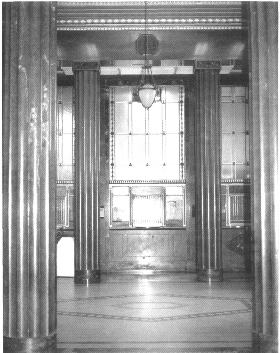
Knoxville Post Office, Knoxville, Tennessee, 1932-33. Sometimes the interior of a building may be as significant or more significant than its exterior. The Knoxville Post Office displays elaborate Art Deco detailing in its lobby, which is one of the most significant interior spaces in the city. (Thomason and Associates)