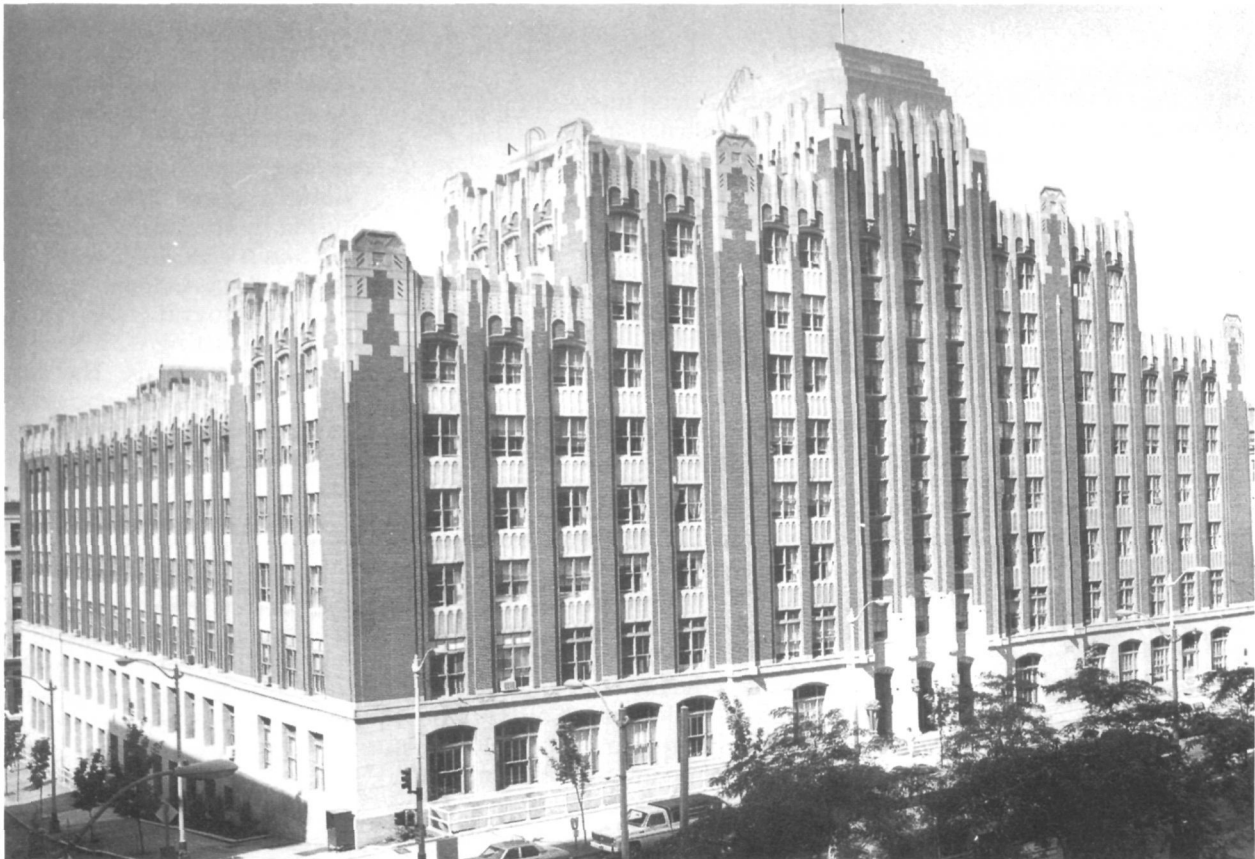
Federal Office Building, Seattle, Washington, 1932-33. In addition to being the city's first building designed especially for Federal offices, this was one of the first Modernistic-styled buildings designed by the Office of the Supervising Architect of the Treasury Department. The innovative use of cast aluminum spandrel panels beneath the windows was the first extensive use of aluminum on the West Coast. Much of the interior Art Deco ornamentation remains intact. (John Kvapil)