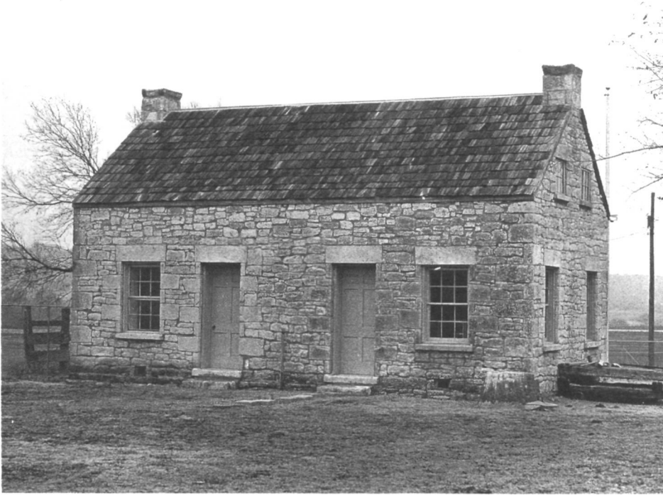
Copperas Cove Stageshop and Post Office, Copperas Cove vicinity, Texas, 1878. This fine example of vernacular stone construction in Texas is the only surviving structure from the original town of Copperas Cove. It served many functions, beginning as a stage relay station and post office.

companies. Postal savings banks were authorized in 1910 in order to encourage thrift, increase the amount of money in circulation, and provide security, especially for those without access to banks. They became particularly popular during the Great Depression of the 1930s, when the government inspired greater confidence than private financial institutions.