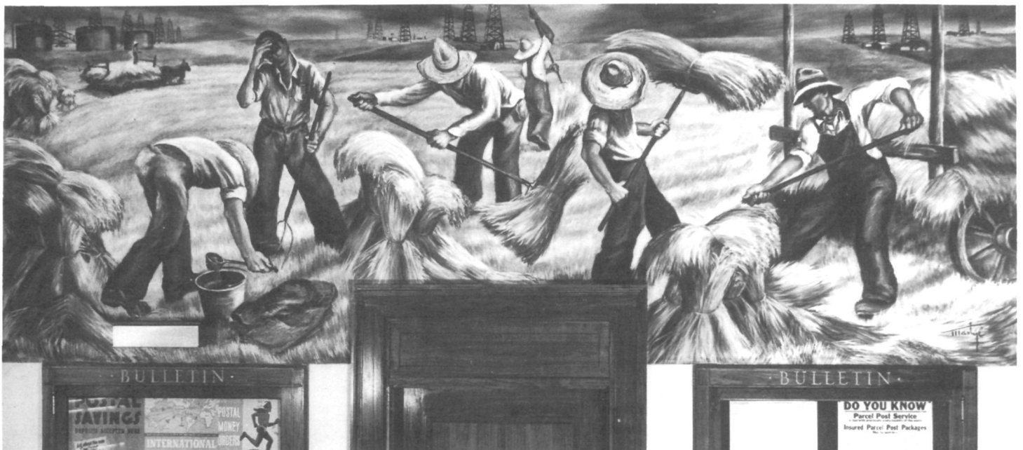
Russell United States Post Office, Russell, Kansas, 1939-1940. The artwork in the Russell post office dramatically depicts the Kansas landscape. "Wheat Workers," an oil on canvas mural, is exceptionally significant at the local and State levels for its historical association with the U.S. Treasury Department's Section of Fine Arts program and for its high degree of physical integrity.