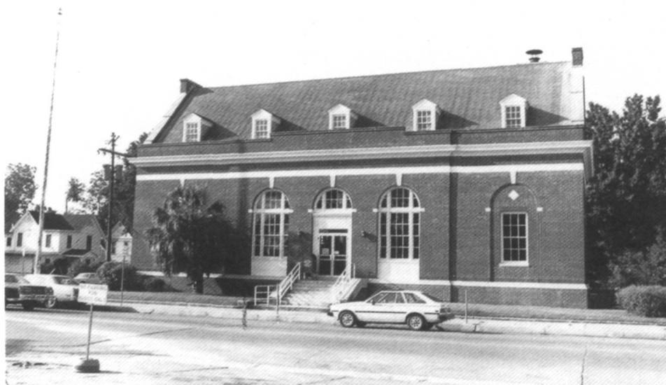
Jennings Post Office, Jennings, Louisiana, 1915. Representing a degree of stylistic sophistication unexpected in a small town in rural Louisiana as early as 1915, the Jennings Post Office is noted for its progressive design in a commercial center otherwise characterized by more modest vernacular buildings. (Jonathan Fricker)

The first step in evaluating a potential historic property is to identify the type, functions, and history of the property being considered. The basic information to obtain for a post office, which falls into the National Register category "building," includes dates of