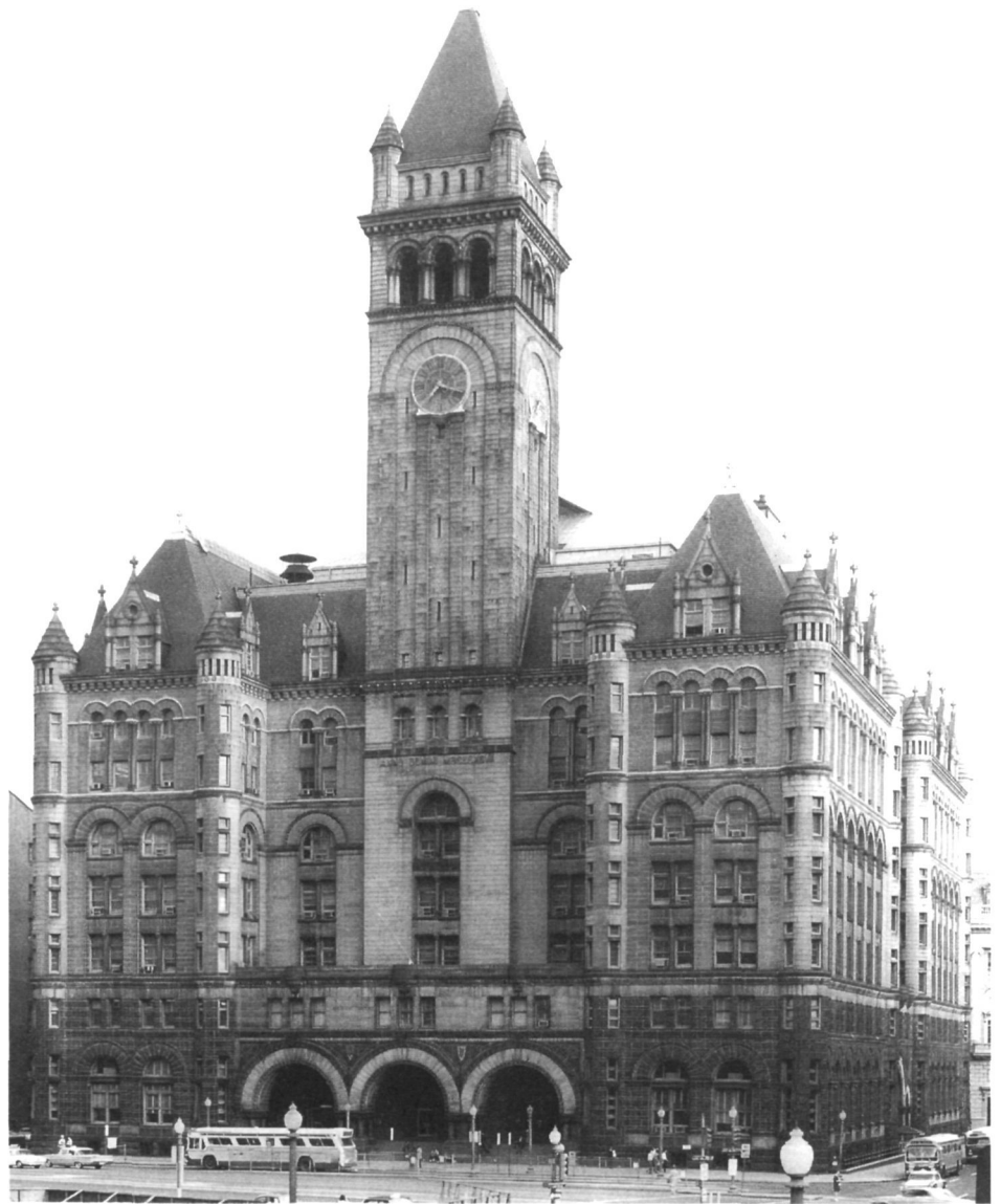
Old Post Office and Clock Tower, District of Columbia, 1891-99. One of Washington's few Romanesque Revival Buildings on a monumental scale, this was the city's third tallest building when completed, exceeded only by the Capitol and the Washington Monument. The Old Post Office was the first Federal building erected in the area now known as the Federal Triangle. It served as headquarters for every Postmaster General from 1899 to 1934. (William Edmund Barrett)

Post offices are important examples of this type of property. In order to facilitate the evaluation and nomination of post offices, the National Park Service conducted a study of various factors in the establishment, role, and design of post offices in order to establish a consistent policy for applying the National Register Criteria for Evaluation to these buildings. The study focused on the history of post offices prior to 1939 to accommodate the impact of major Federal programs of the Depression. The following guidance for evaluating the significance of post offices using the National Register Criteria resulted from this study. This second edition of National Register Bulletin 13 also looks at post offices built after World War II. This publication is intended to assist anyone in the evaluation of the eligibility of post offices for inclusion in the National Register, and to suggest an appropriate approach for evaluating other similar resources.