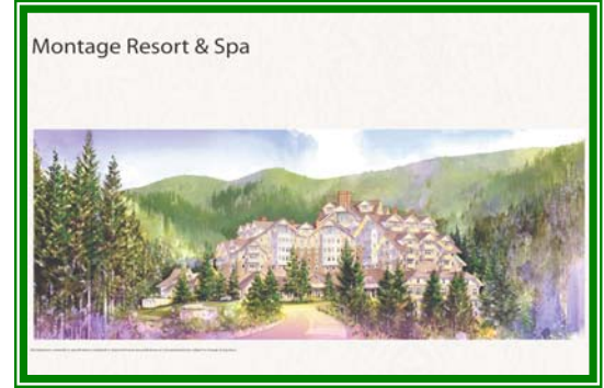
ARTIST RENDERING OF PROPOSED MONTAGE DEVELOPMENT