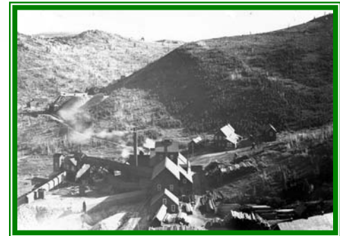
1907 – DALY WEST MINE SUMMIT COUNTY, UTAH

DV Luxury Resort, LLC (DVLR) has proposed the construction of a hotel, spa and condominium project at the Daly West Mine Site, to be known as the Montage Resort & Spa. The development will contribute to the cleanup of contamination at this former mining site in Park City, Utah. DVLR has also agreed to participate in EPA's initiative to encourage environmentally responsible redevelopment and reuse of contaminated properties (ER3). As an ER3 participant, the Montage Resort & Spa will incorporate "green" features into the design, construction, and operation of the development to minimize the project's environmental footprint.