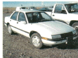
1993 Chevrolet Corsica