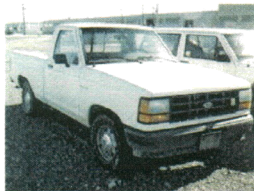
1990 Ford Ranger Compact Pickup