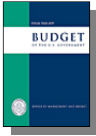
Budget of the United States Government: Fiscal Year 2009

http://www.gpoaccess.gov/usbudget/index.html