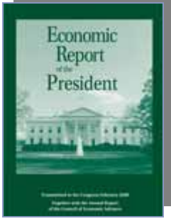
Economic Report of the President