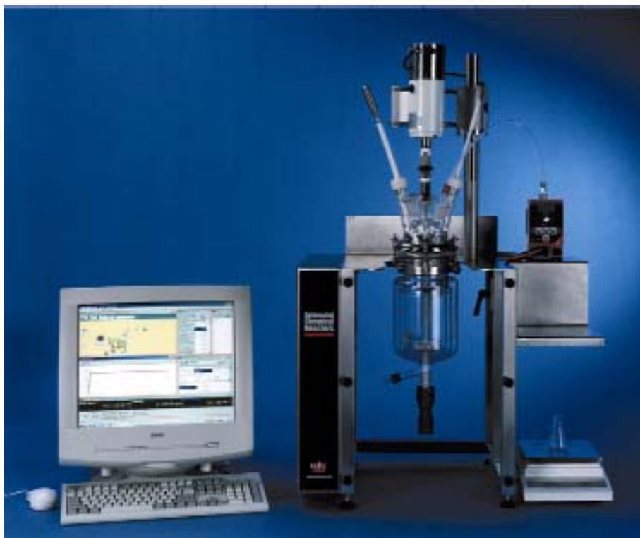
KCP CHEMICAL DATABASE: A reaction calorimeter helps test chemical recipes.

For now, the team is focusing the project on the molecular design and optimization of urethane encapsulants and adhesives, but Wilson said their work will eventually be applied to other materials at the Kansas City Plant, such as epoxies.