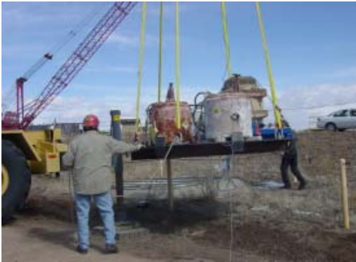
RADIOACTIVE SEALED SOURCES: RTGs being placed in an underground storage shaft at Los Alamos National Laboratory.