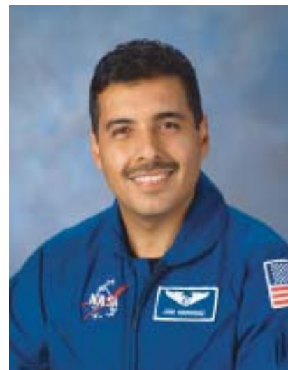
Jose M. Hernandez