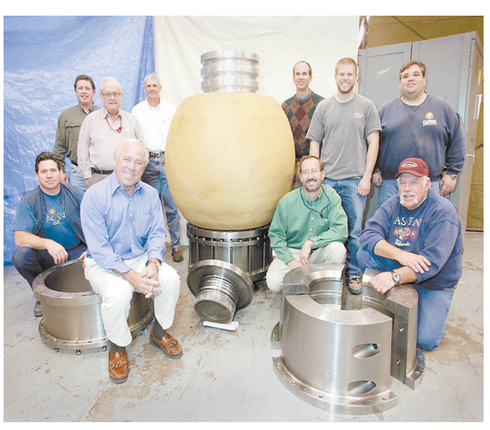
EXPLOSIVE EXPERIMENT CONTAINERS: Prototype containment vessel for explosive experiments.

The development of a full-size 2 meter vessel has been a joint project with Los Alamos National Laboratory (LANL), home to the state-ofthe-art Dual Axis Radiographic Hydrotest Facility or DARHT. LANL may house the next generation Advanced Hydrotest Facility experimental facilities likely to use the newly designed vessels.