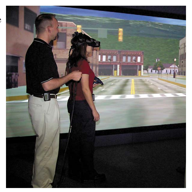
VIRTUAL REALITY WALK-THROUGH: Kansas City Plant employees perform an architectural walkthrough of a makebelieve town. The new system allows designers to share detailed CAD drawings of electrical and mechanical designs in product realization team meetings and customer presentations.

SGI, Linux and PC computing sources can be accessed to drive the display. Construction of the Immersion Room was funded through the ADAPT Digital Collaboration project. In the Immersion Room, finite element analysis simulation results and animations from a system of supercomputers can be displayed. Architectural walkthroughs allow associates to experience the look and feel of a redesigned work area, and accident reenactments can provide valuable safety lessons.