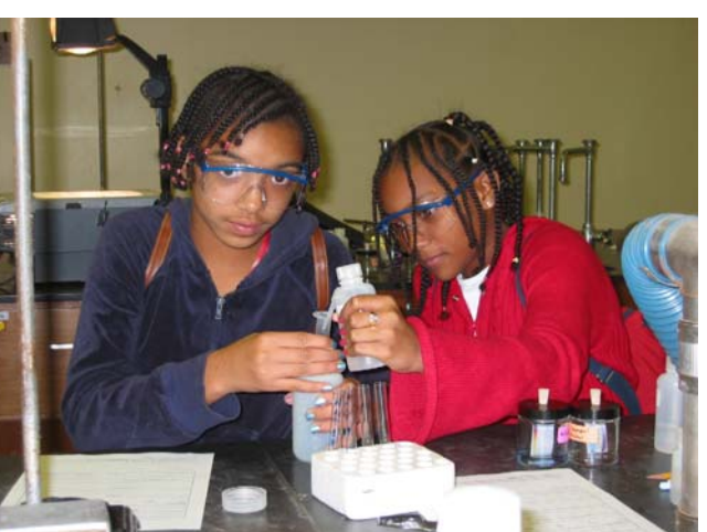
MATH AND SCIENCE CONFERENCE: Expanding Your Horizons participants analyze samples in a chemistry lab.

EYH participants were offered some 30 hands-on, interactive workshops throughout the campus. From biology and DNA to robotics and chemistry, the presentations are the focal point of every EYH conference, inviting girls to take a closer look at science, mathematics, and non-traditional