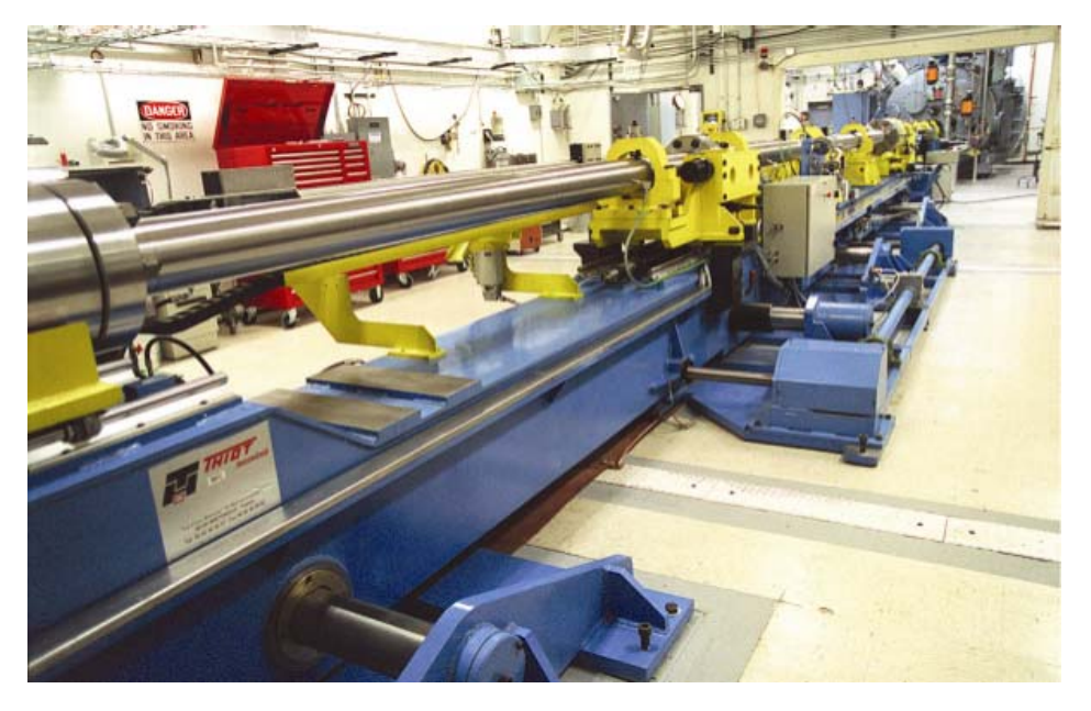
LLNL AND NTS SHOCK PHYSICS EXPERIMENTS: JASPER two-stage gun at the Nevada Test Site.

plutonium's equation of state (EOS). EOS is the relationship between the pressure, density and temperature of plutonium at extreme conditions that encompasses millions of atmospheres pressure, and temperatures in thousands of degrees Kelvin. JASPER uses shock waves generated by high-velocity impacts to