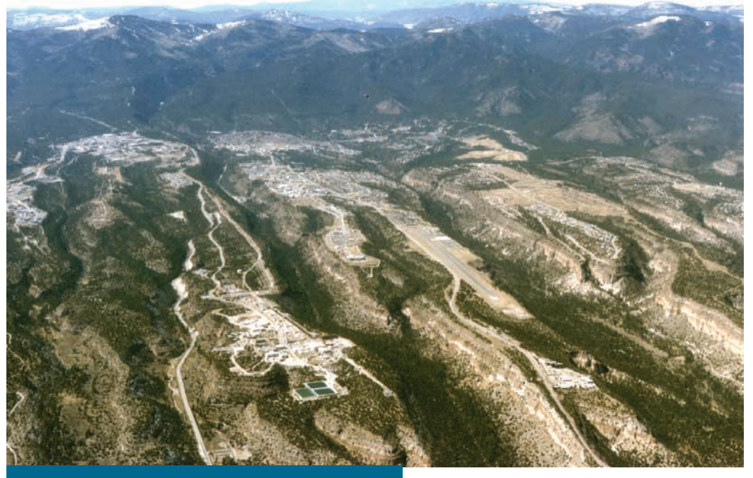
LOS ALAMOS NATIONAL LABORATORY: A high southwest view of Los Alamos National Laboratory in New Mexico.

The new Los Alamos computer, nicknamed "Roadrunner," is expected to run scientific calculations of highly complex phenomena that are 10 times more detailed than available from any existing computer. It will also establish Los Alamos as the leading contender to win the worldwide race for a sustained performance level of 1 petaflop, or a billion million computations per second.