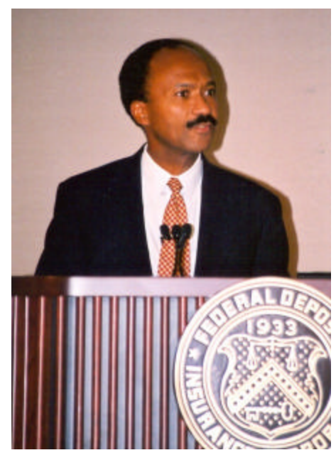
Mr. Raines discussed Fannie Mae's risk management practices and the importance of sound risk management procedures.

a minimum capital level, 4) operating under a risk based capital approach, 5) maintaining liquid assets to meet unexpected demands, 6) strengthening market discipline by issuing market-priced subordinated debt, and 7) ensuring sound financial disclosures. In the end, Mr. Raines stressed that risk management and risk mitigation must continue to be strengthened to restore public confidence in corporate America.