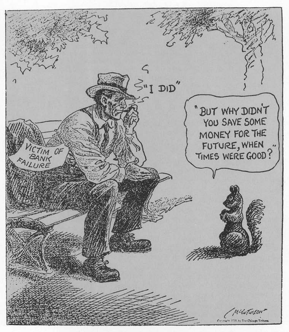
This 1931 cartoon was awarded a Pulitzer Prize the following year.