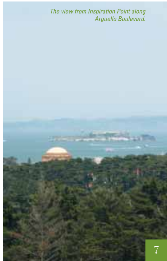
The view from Inspiration Point along Arguello Boulevard.

The most recent scenic drive is Mason Street along Crissy Field with its exhilarating view over the marsh and grass airfield towards the bay, Angel Island, the Golden Gate Bridge, and Marin County. The scenic drives are important features of the park and will be enhanced with overlooks that will increase the public's enjoyment of the park's sweeping vistas.