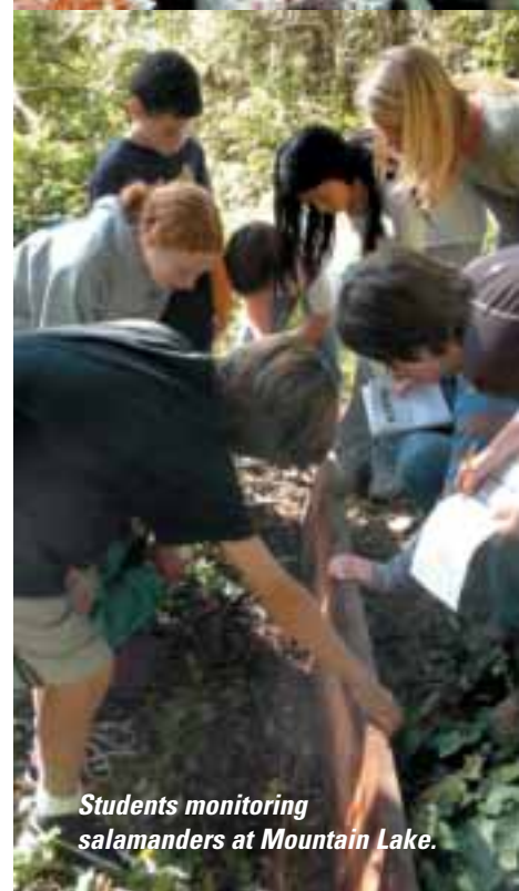
Students monitoring salamanders at Mountain Lake.