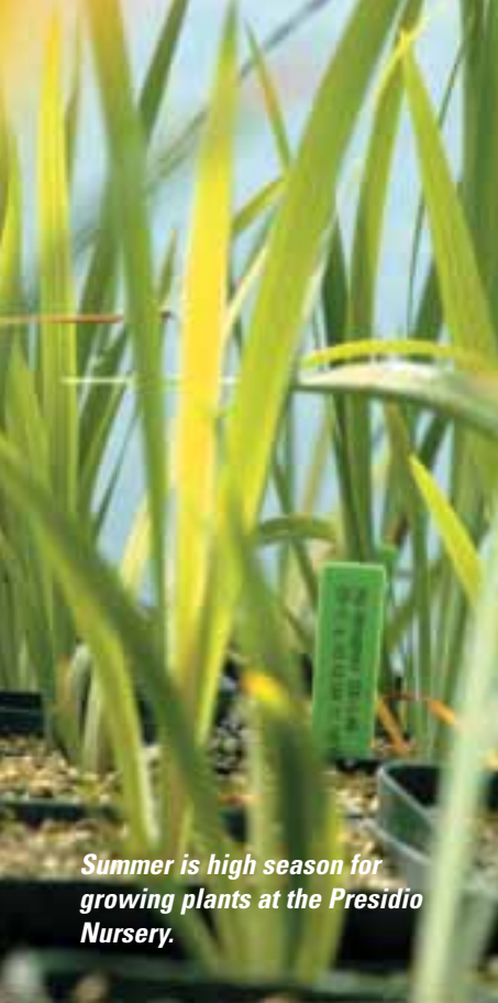
Summer is high season for growing plants at the Presidio Nursery.