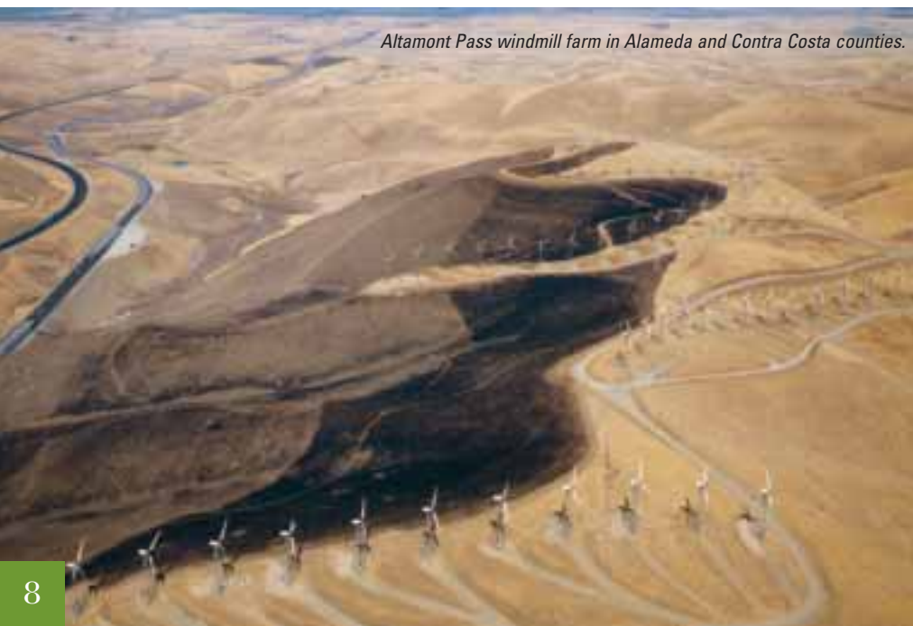
Altamont Pass windmill farm in Alameda and Contra Costa counties.