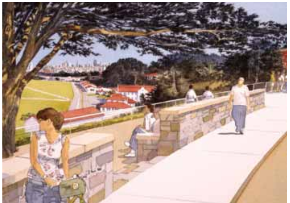
A new scenic overlook will soon be constructed along Lincoln Boulevard above Crissy Field.