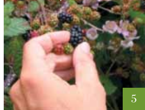
Five-leaved Himalayan blackberries provide late summer snacks (reasonable quantities may be collected in the Presidio).