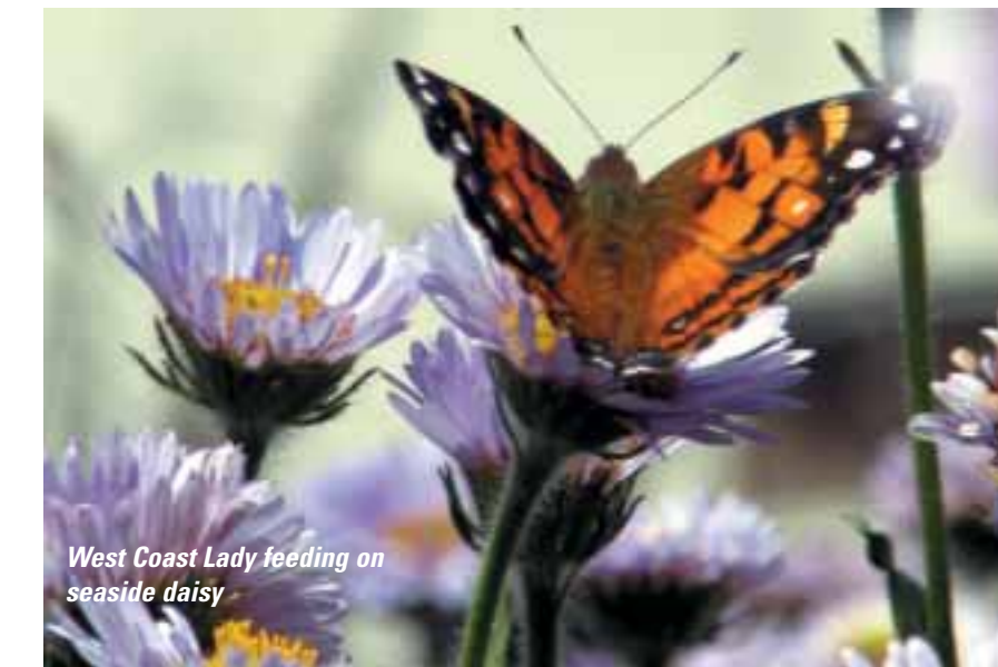
West Coast Lady feeding on seaside daisy