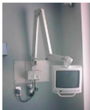
A typical hospital television mounted on an articulating arm.

Many of our hospital sleeping rooms have small televisions mounted on articulating arms serving each patient bed. These televisions generally operate at 12 to 24 volts direct current (DC) with the power often supplied to the unit through a coaxial cable which also carries the television signal. The coaxial cable is connected to a transformer and