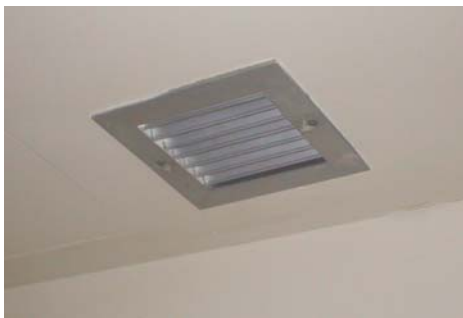
Photo 1: Louvered HVAC grille mounted using standard slotted screws.