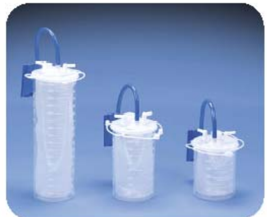
3200cc, 1800cc and 1300cc sizes