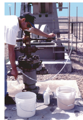
Figure 2. USGS chemist prepares to sample water from the wellhead of a coalbed methane well. Wellhead sampling and on-site sample preservation and analysis are critical to obtaining good quality compositional and isotopic data. Many parameters, such as pH, alkalinity, and trace-metal content, change rapidly once the water is removed from the well.

methane desorption, and water composition and isotopic values. Researchers from the USGS, Bureau of Land Management, Bureau of Indian Affairs, State agencies, and private companies are cooperating in an effort to provide a better understanding of CBM resources and associated water.