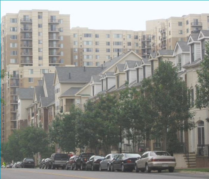
Development in Arlington County's Rosslyn-Ballston corridor.

“We really appreciated receiving the EPA’s Smart Growth Award. Not only because of the attention it focused on Arlington, but because EPA has helped us to explore ways of maintaining housing affordability in our transit corridors.”