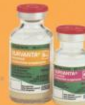
SURVANTA ® (beractant) intratracheal suspension bovine pulmonary surfactant

Our history confirms, Survanta is safe and effective.