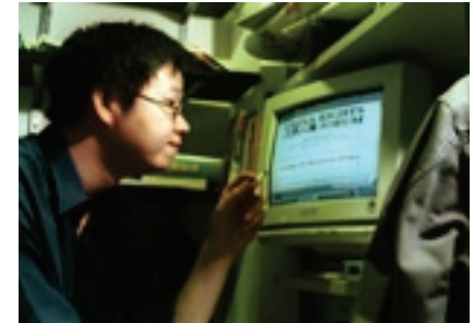
A man in China surfs the Internet. Modern technology makes it possible for human rights organizations to connect with one another, and share their message with the world.

National and international norms and expectations are being altered for the better. The idea of human rights has a moral force and mobilizing power that is hard to resist in today's world. And as more and more citizens throughout the world come to think of themselves as endowed with inalienable rights,