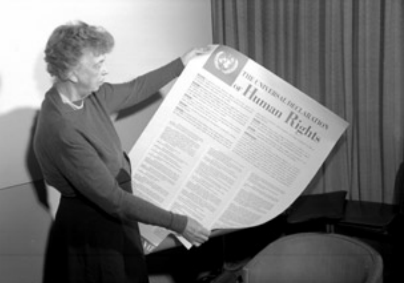
Following the bloodshed of World War II, a global charter for human rights took on a new urgency. Here, Eleanor Roosevelt, widow of President Franklin D. Roosevelt, holds the United Nations Universal Declaration of Human Rights.

consistent pattern of gross human rights violations is widely considered to be illegitimate.