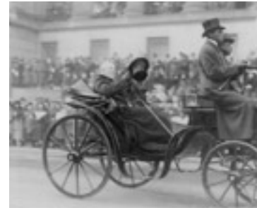
President Woodrow Wilson celebrates Armistice Day, 1921. Following World War I, Wilson's idealism led to the founding of the League of Nations (the first attempt to form a United Nations) and to still-prevailing theories of international order.

in Japan. The United States was a leader in decolonization, granting independence to the Philippines in 1946. And with the end of the Cold War, the United States has emerged as a leader in multilateral human rights and humanitarian initiatives in Somalia, Sudan, Haiti, Bosnia, and other countries.