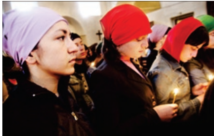
A women's group in ex-Soviet Georgia. The concept of women's rights, a largely 20th-century phenomenon, has arisen as concern for human rights in general has risen.

The 1995 United Nations Fourth World Conference on Women in Beijing attempted to place women's issues within the mainstream of international human rights discussions. With its emphasis on "good governance," the World Bank highlights important human rights issues. The Council of Europe and the European Union have stressed that countries seeking to join the political structures of Europe must have policies that protect human rights. In 2002, the United States established the Millennium Challenge Corporation to provide economic