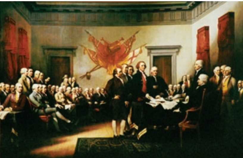
In this painting by John Trumbull, Thomas Jefferson presents the Declaration of Independence to John Hancock at the Continental Congress in Philadelphia, 1776. The drafters knew the document would lead to war with Britain, but could not imagine its philosophic impact.