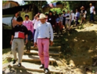
Local officials in Chiapas, Mexico, welcome a group of international human rights observers, 2002 following years of government clashes with armed rebels identified with indigenous groups.

Another set of multilateral human rights monitoring