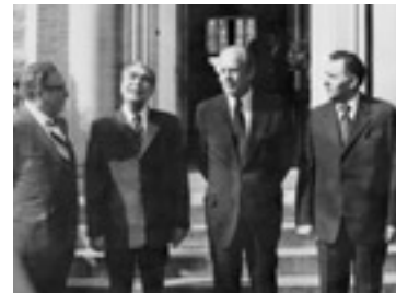
Soviet leader Leonid Brezhnev, center left, poses with U.S. President Gerald Ford in July 1975 in Helsinki, Finland. The "Helsinki Process" meetings on human rights issues between capitalist and Communist nations helped undermine the Soviet empire, showing that ideas matter.

The CSCE's final act, reached in 1975 in Helsinki, Finland, and signed by 35 countries, became known as the Helsinki Accords. The accords cited 10 specific principles, including respect for human rights and