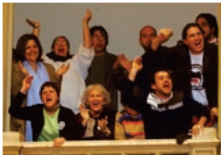
Members of rights groups cheer in the Argentine Congress following a vote by Argentina's Senate to revoke amnesty for those who committed human rights abuses in the '70s and '80s. The damage done by such abuses can linger for decades.

However, the power of NGOs is limited. They must rely on the power of publicity and persuasion. Many states have used their powers of coercion against local members of human rights NGOs, turning