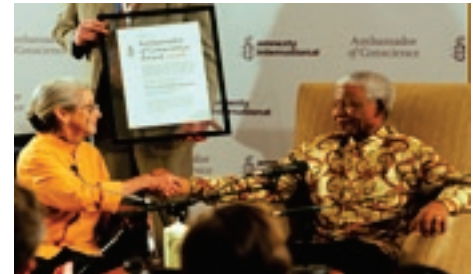
Former South African President Nelson Mandela (right) receives an award in Johannesburg, 2006. The principle of black majority rule (personified by Mandela) — as opposed to white minority rule — for South Africa became one of the major rights issues of the 20th century.

African Union Mission troops have been unable to stop the widespread killing and rape, and the United States has urged the United Nations to deploy a large peacekeeping force in the country. At the same time, the