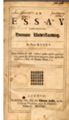
Locke's "An Essay Concerning Human Understanding" asserted the importance and complexity, and thus the dignity, of the subjective self.

T raditionally, all groups of humans, from clans of forest dwellers to urban sophisticates, have had notions of justice, fairness, dignity, and respect. However, the notion that all human beings, simply because they are human, have certain inalienable rights they may use to protect themselves against society and its rulers was a minority view in the era before the 1500s.