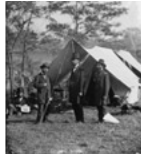
President Abraham Lincoln at the Antietam battleground, 1862. The U.S. Civil War, pitting the non-slaveholding North against the slaveholding South, ended slavery in North America forever, and made human rights concerns a perpetual part of American society and culture.

There are, of course, less attractive sides to the U.S. heritage. Slavery was an accepted practice in the southern states during the first 75 years of the American republic, and racial discrimination in schools, public accommodations, and social practices was the norm for much of its second century. The American Indians, as they were then called, were forced to move westward, losing their homes, their lands, and often their lives. Women were denied the right to vote in elections, the right to serve on juries, and even the right to hold property as a wife. But one of the features of American democracy is that self-