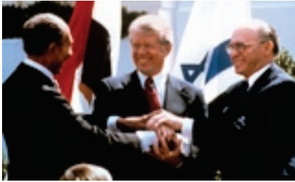
Throughout history, tribal and religious hatreds have been the bane of human rights. U.S. President Jimmy Carter (center) considered the 1979 peace treaty between Egypt and Israel a hallmark of his presidency. Yet, its promise foundered on these antagonisms.

By the end of the 1980s the Cold War had come to an end, and on December 25, 1991, the Soviet flag was lowered from the Kremlin. The CSCE, which up to this point had convened meetings and conferences, now took on a greater role—managing the historic change taking place in Europe. Its name changed to the Organization for Security and Cooperation in Europe (OSCE). It is now the largest regional security organization in the world, comprising 56 countries from Europe, Central Asia, and North America. It also has partner states in Asia and the Mediterranean region. Many people see the OSCE as a prototype for other regional cooperative efforts to forge greater respect for human rights in other parts of the world. The Copenhagen Declaration and the Paris Principles of the OSCE have become enormously influential as a measure for human rights performance, including the record of democratic states.