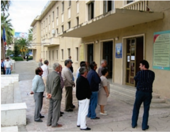
People read about their rights on a wall poster on a municipal building in Albania.

assistance to countries that govern democratically, invest in their people, and encourage economic freedom.