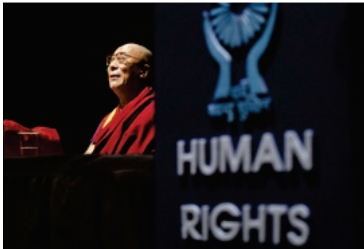
The Dalai Lama, the spiritual leader of Tibet, speaks at a human rights conference in New Delhi, India. Tibet, a beleaguered ethnic enclave, has come to symbolize the rights of ethnic minorities.

In 2006, the Human Rights Commission was abolished in favor of a smaller Human Rights Council. The new Council has had a difficult start. It has been criticized for abolishing special rapporteurs for countries such as Belarus and Cuba without apparent reason. In addition, the Human Rights Council has perpetuated the discriminatory practice of having a permanent agenda item for only one country, namely, Israel, in relation to the Palestinian situation. The new human rights machinery in Geneva also has diminished the role of NGOs in the Council’s formal sessions, and continues to exclude Israel from membership in any of the regional groups that organize the work in Geneva. There is some hope that so-called “universal