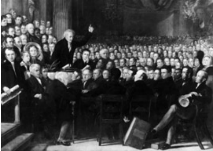
This scene by British painter Benjamin Haydon shows a meeting of an anti-slavery society in 1840. In Britain and America, anti-slavery societies vehemently opposed the slave trade — an example of a political movement inspired by conscience.

as for isolated instances of prisoner abuse by the U.S. military during the Iraq War. The boundaries of rights in instances of conflicts involving terrorists — who, after all, are out to destroy everybody's rights — are still being debated in civilized societies.