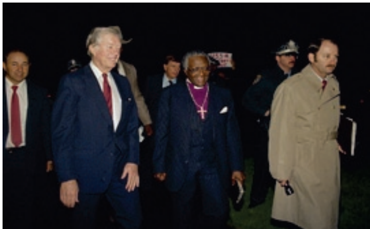
President Jimmy Carter and Nobel Peace Prize laureate Desmond M. Tutu in 1986. Carter wanted human rights to be a central concern of U.S. diplomacy.

Carter attempted to disentangle international human rights from the East-West politics of the Cold War and from North-South arguments between the industrialized and non-industrialized countries over economic matters. This gave