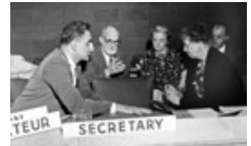
This picture shows Eleanor Roosevelt (right) discussing a draft document with the United Nations Commission on Human Rights. An outspoken humanitarian, Eleanor Roosevelt helped shape the liberal intellectual climate of the times.

The Nuremberg War Crimes Trials in 1945 helped to change the situation. The