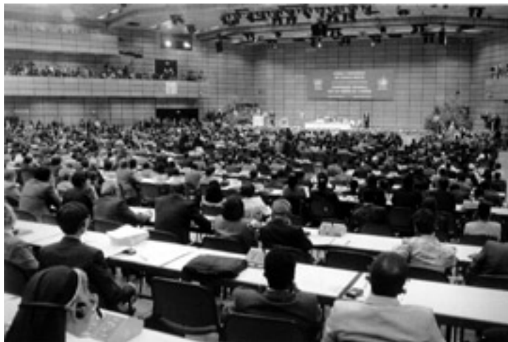
Opening ceremony at the United Nations World Conference on Human Rights, Vienna, 1993. Human rights concerns, if not always implemented, are now an element of the global agenda.

A t least theoretically, states are increasingly accountable to the international community for their human rights practices. More than three-fourths of the countries of the world have ratified the International Human Rights Covenants.