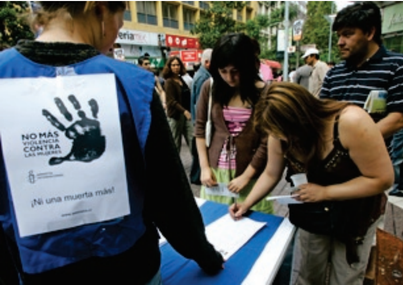
A woman collects signatures for a campaign against domestic violence in Santiago, Chile. The sign on her shirt reads "No more violence against women."

armed conflict and international humanitarian law, seeking to protect civilians and noncombatants in those civil war conflicts. Special tribunals were established for Sierra Leone in 2002 and Cambodia in 2003 to prosecute military and political leaders responsible for atrocities during times of war and genocide. In addition, although the United States has not joined as a treaty party, and has expressed certain reservations about its scope, the International Criminal Court was established in 1998 by the Rome treaty, and has been tasked by the U.N. Security Council