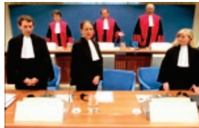
The United Nations criminal tribunal for the former Yugoslavia, The Hague, 1995. International juridical tribunals have been used to pursue war criminals of failed states, in this instance, the commander of a Bosnian concentration camp.

T he 1993 Vienna World Conference on Human Rights helped refocus international attention on human rights in the post-Cold War world. The war crimes tribunals for the former Yugoslavia and Rwanda, established by the U.N. Security Council in 1993 and 1994, have developed the law of