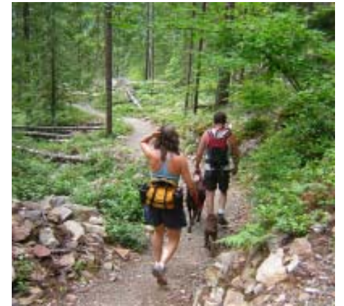
Hikers along the Thunder Knob hiking trail.