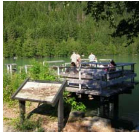
Visitors fish from the accessible fishing dock at Colonial Creek campground.