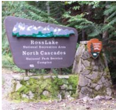
This sign marks an entrance to Ross Lake National Recreation Area and North Cascades National Park Service Complex.