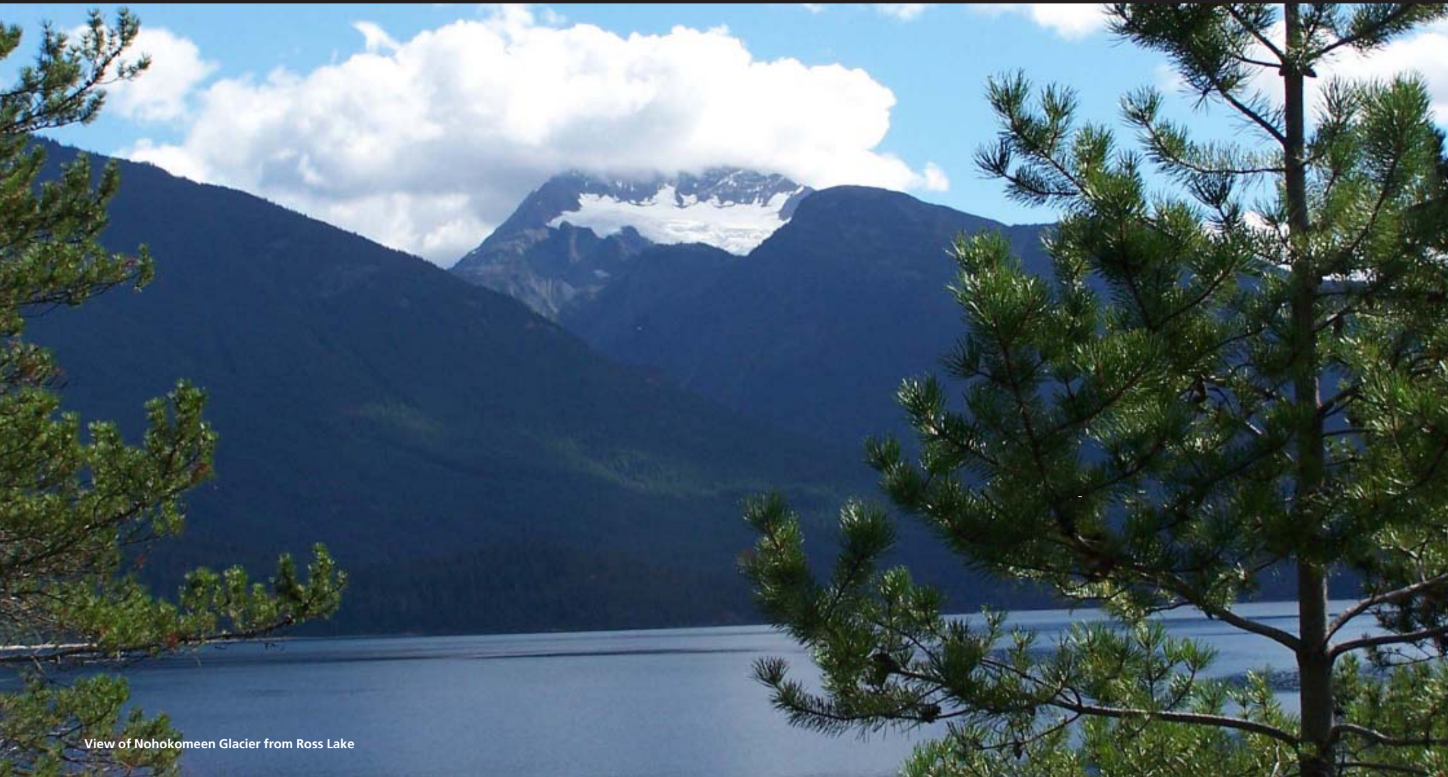
View of Nohokomeen Glacier from Ross Lake