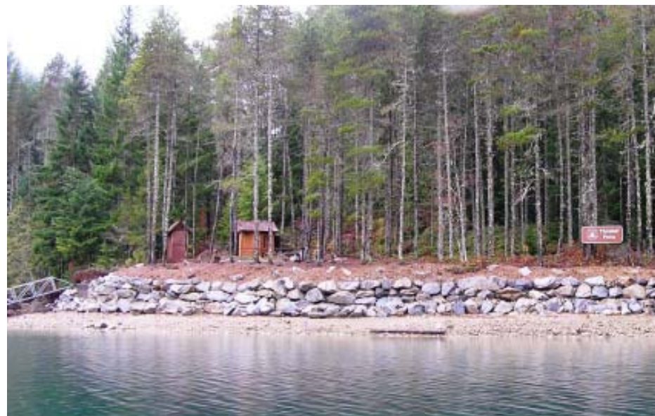
Thunder Point campground is one of many boat-in campgrounds at Ross Lake NRA.