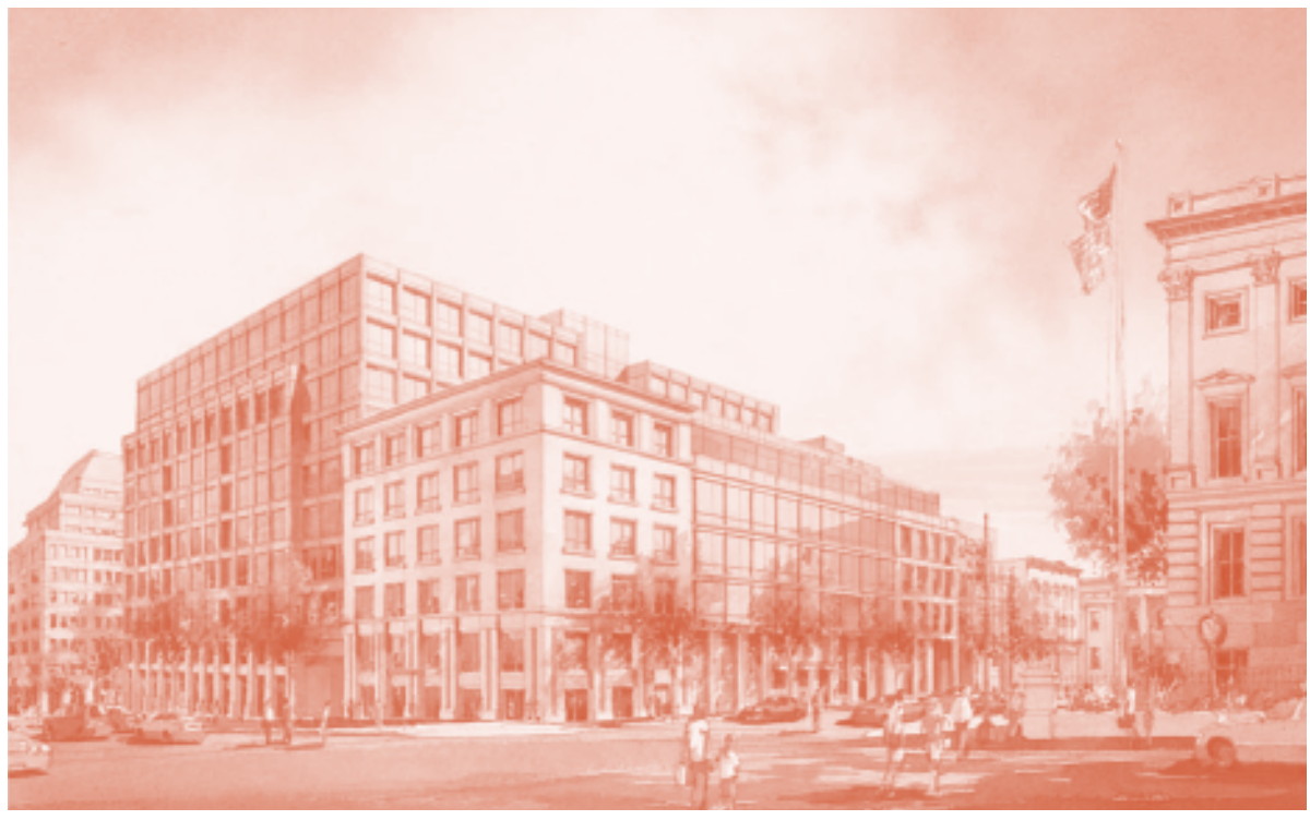
Mixed-use development planned for E Street, NW between 8th and 9th Streets