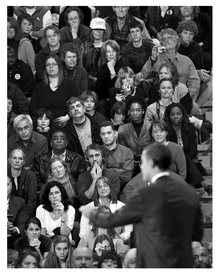
A diverse audience listens to candidate Obama speak in Wallingford, Pennsylvania.

In the white community, the path to a more perfect union means acknowledging that what ails the African-American community does not just exist in the minds of black people; that the legacy of discrimination — and current incidents of discrimination, while less overt than in the past — are real and must be addressed. Not just with words, but with deeds — by investing in our schools and our communities; by enforcing our civil rights laws and ensuring fairness in our criminal justice system; by providing this generation with ladders of opportunity that were unavailable for previous generations. It requires all Americans to realize that your dreams do not have to come at the expense of my dreams; that investing in the health, welfare, and education of black and brown and white children will ultimately help all of America prosper.