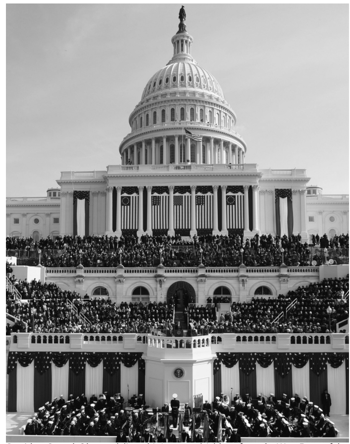
President Barack Obama delivers his Inaugural Address from the West Front of the U.S. Capitol in Washington, DC, January 20, 2009.