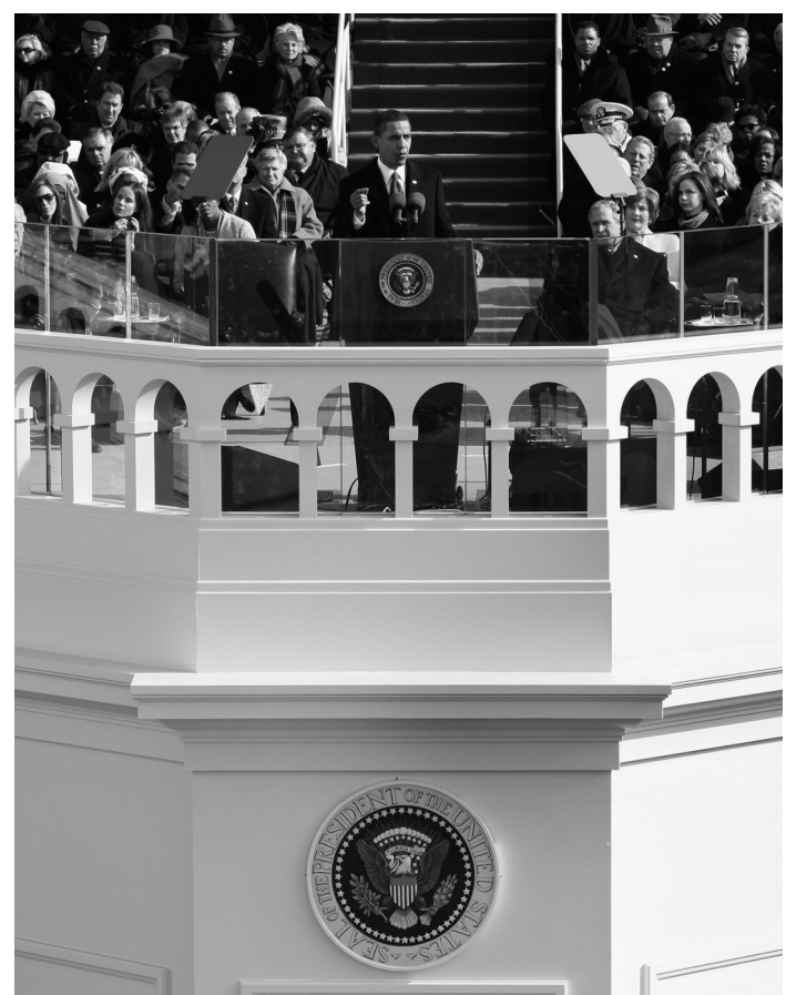
At the U.S. Capitol in Washington, DC, President Barack Obama delivers his Inaugural Address, January 20, 2009.