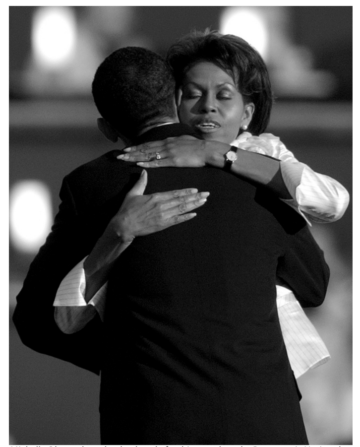
Michelle Obama hugs her husband after his speech to the Democratic National Convention, July 27, 2004.

In the end, that's what this election is about. Do we participate in a politics of cynicism or a politics of hope? ... I'm not talking about blind optimism here - the almost willful ignorance that thinks unemployment will go away if we just don't talk about it, or the health care crisis will solve itself if we just ignore it. No, I'm talking about something more substantial. It's the hope of slaves sitting around a fire singing freedom songs; the hope of immigrants setting out for distant shores; ... the hope of a skinny kid with a funny name who believes that America has a place for him, too. The audacity of hope!