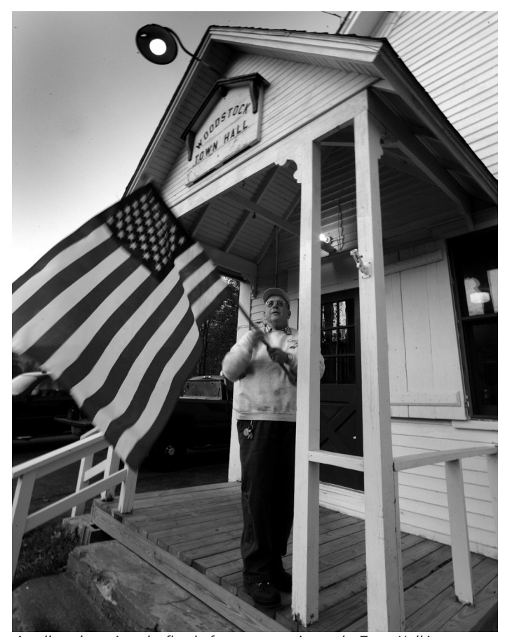
A poll worker raises the flag before voters arrive at the Town Hall in Woodstock, New Hampshire, on Election Day 2008.

That is the liberty we defend – the liberty of each of us to pursue our own dreams. That is the equality we seek – not an equality of results, but the chance of every single one of us to make it if we try. That is the community we strive to build – one in which we trust in this sometimes messy democracy of ours, one in which we continue to insist that there is nothing we cannot do when we put our mind to it, one in which we see ourselves as part of a larger story, our own fates wrapped up in the fates of those who share allegiance to America's happy and singular creed.