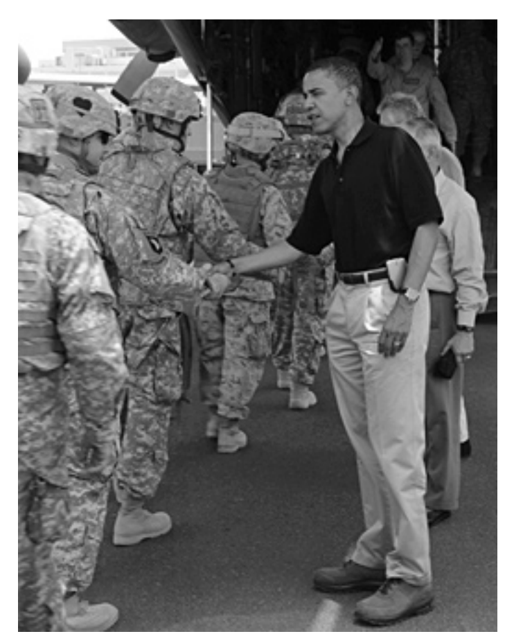
Barack Obama greets U.S. soldiers in Kuwait, July 18, 2008.