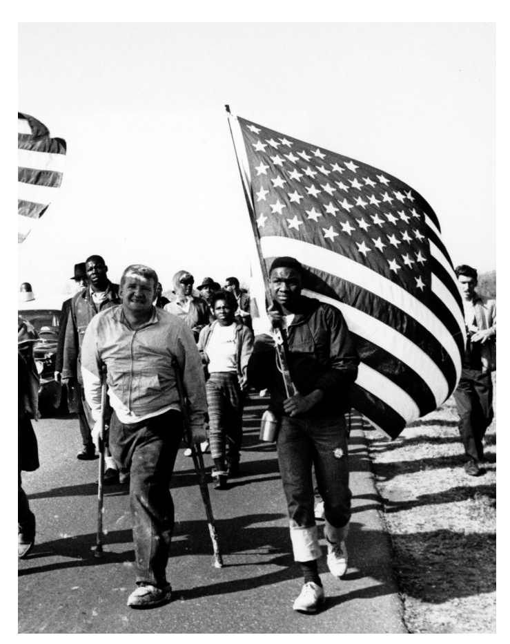
Civil rights marchers near Montgomery, Alabama, March 1965.