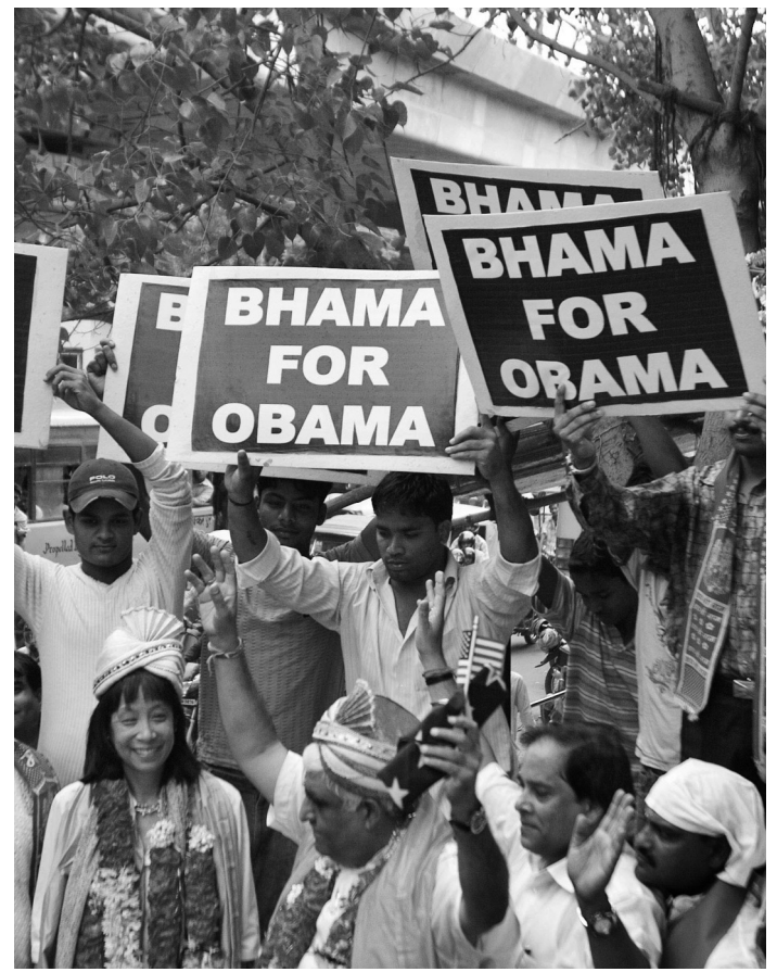
Obama supporters in New Delhi, India, June 24, 2008.

We will have to provide meaningful resources to meet critical priorities. I know development assistance is not the most popular program, but as President, I will make the case to the American people that it can be our best investment in increasing the common security of the entire world. That was true with the Marshall Plan, and that must be true today. That's why I'll double our foreign assistance to $50 billion by 2012, and use it to support a stable future in failing states, and sustainable growth in Africa; to halve global poverty and to roll back disease. To send once more a message to those yearning faces beyond our shores that says, "You matter to us. Your future is our future. And our moment is now."