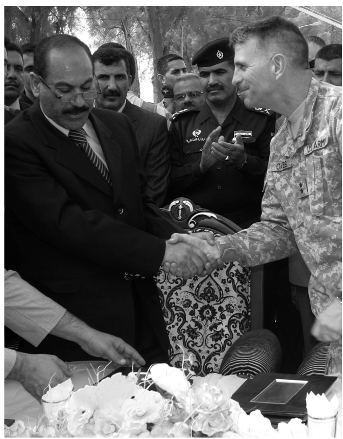
A transfer ceremony in Hilla, Iraq, October 23, 2008.