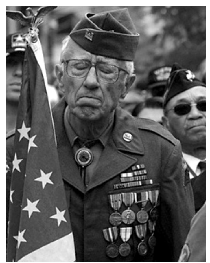
A veteran of World War II is moved by emotion at a Veteran's Day ceremony in New York City, November 11, 2003.