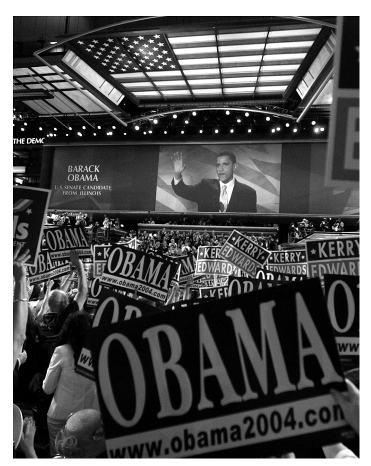
Barack Obama speaks before the Democratic National Convention, July 27, 2004.