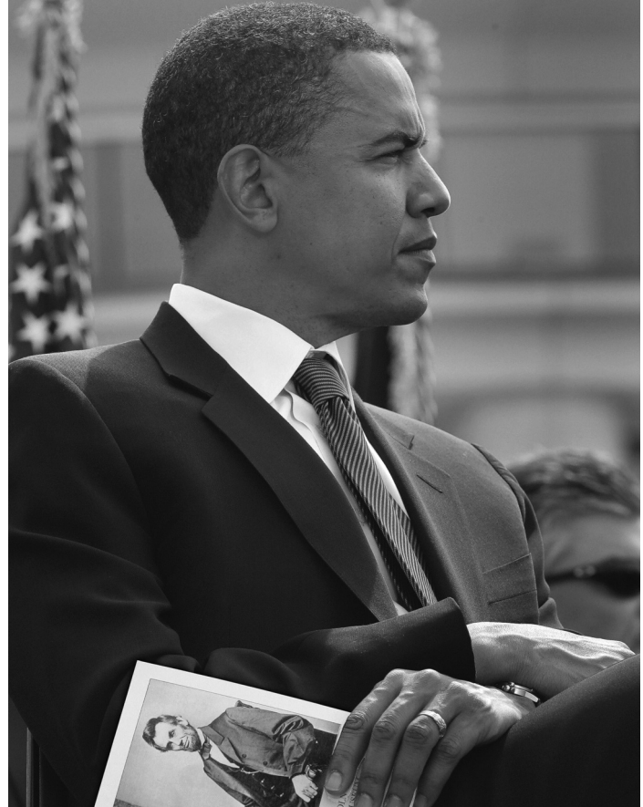
A longtime admirer of Abraham Lincoln, Barack Obama attends the opening ceremonies of the Abraham Lincoln Presidential Museum in Springfield, Illinois.

Not just to hold an office, but to gather with you to transform a nation.