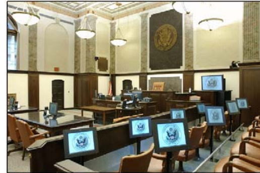
Courtroom 204, Toledo

The courtrooms are augmented by video and audio conferencing systems. Two video-conferencing cameras are focused on the Judge and witness, as well as the presenter at the lectern.