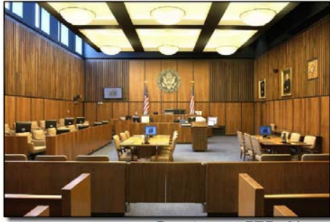
Courtroom 575, Akron