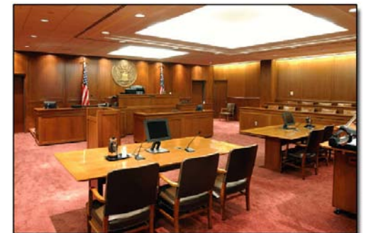
Courtroom 313, Youngstown