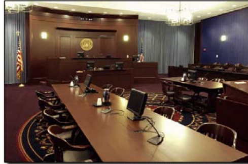
Courtroom 16A, Cleveland