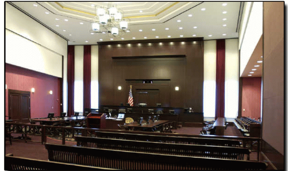
Courtroom 19A, Cleveland

The U.S. District Court, Northern District of Ohio is proud to provide fourteen electronic courtrooms throughout the district with more being planned.