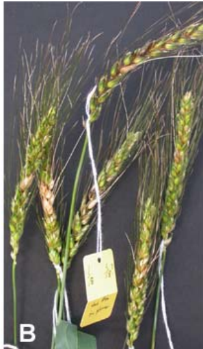
Reaction to point-inoculated Fusarium head blight in a cultivated emmer wheat plant (A) and a Persian wheat plant (B) showing low levels of infection.

Fusarium head blight (FHB), commonly known as scab, is a destructive fungal disease of wheat and barley in humid growth conditions throughout the world. In the last decade, FHB epidemics in the United States and Canada have caused serious yield losses. In fact, direct economic losses to wheat and barley