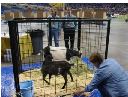
Baby goats were popular.