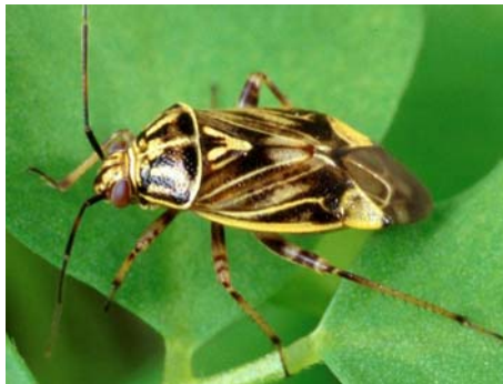
Tarnished plant bug, Lygus lineolaris .

Lygus bugs are a genus of closely related plant feeding insects with a broad host of weeds and cultivated crops. The tarnished plant bug, Lygus lineolaris , is North America's most widely dispersed member of this group. They attack a wide array of economically significant plants across the nation. In the northern Plains they are mostly noticed in canola, sugarbeets, alfalfa, and sunflowers. In the southern USA they are a significant pest of cotton. There have long been questions about whether the insects that feed on