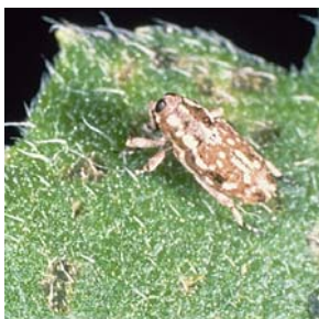
Adult Sunflower Stem Weevil