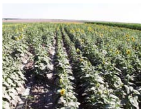
Insect screening nursery at Kansas State University NW Research Extension Center, Colby, KS.