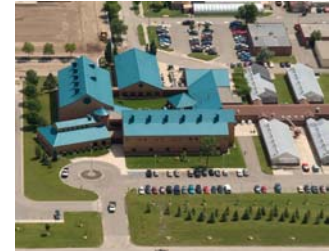
Northern Crop Science Laboratory Fargo, ND