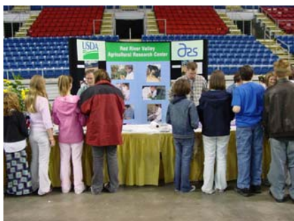
A busy booth.