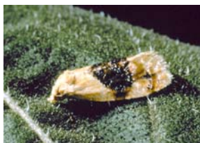
Adult Banded Sunflower Moth