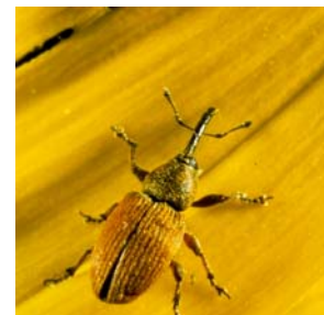
Adult Red Sunflower Seed Weevil