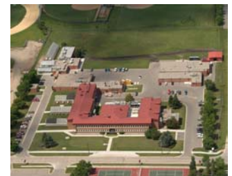
Biosciences Research Laboratory Fargo, ND