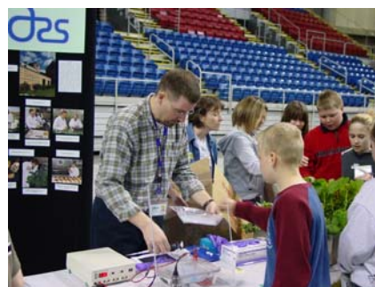
The gel electrophoresis display.