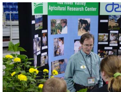
Interacting with the students.