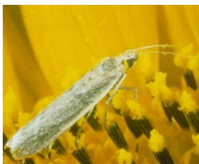
Adult Sunflower Moth