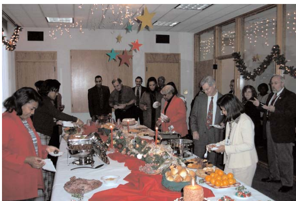
The party begins at the Executive Office Holiday open house.