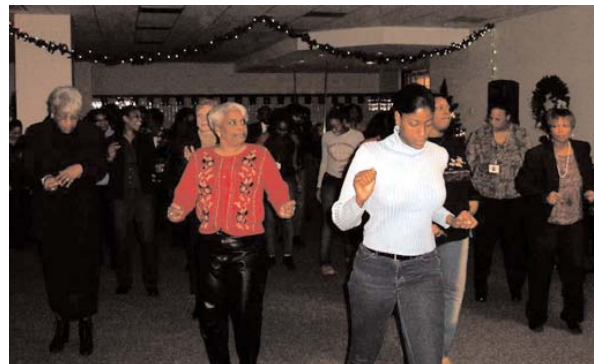
Everyone enjoyed the refreshments, entertainment and dancing.