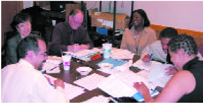
DV Unit working on a MAP strategy.

An additional Family Court MAP is being implemented to “enhance the timely processing of detained juveniles by increasing compliance with statutory requirements for bringing detained juveniles to trial by 30% over 2004 levels.” With the