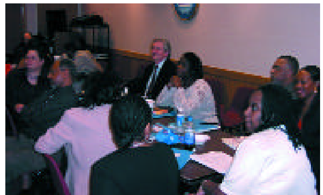
Family Court staff during a MAP training session.

As part of their plan to address Strategy 1.1.1, the Domestic Violence Unit revised procedures for the Control Courtroom, the courtroom handling most CPO hearings each day. Under the new procedures, each clerk monitors how many cases are set for each day — thereby controlling the number of hearings set. A maximum standard had been written stating, “no more than 25 hearings are to be set per day for 90% or more of court dates.” With this standard for number of cases to be set, the Domestic Violence Unit has improved customer service through less waiting time and firm hearing dates. Additionally, there is a better use of judicial bench time. A review of the Control Courtroom's