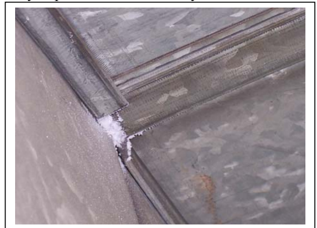
Fig. 1: A look inside sealed ductwork: note buildup of polymer sealant