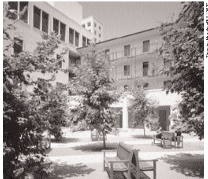
Figure 2. Bren Hall features an open courtyard between laboratory and office wings.

In 1997, the school received a sizable endowment from the Donald L. Bren Foundation, established by Donald Bren, a California real estate developer who strongly supports sustainable design. Although the design process for a new building had already begun, the school advisory board decided at that point that a School of Environmental Science & Management should be a living laboratory. So, the project moved from simply constructing a building in which environmental science is taught to creating a structure that is itself an example of environmental sensitivity.