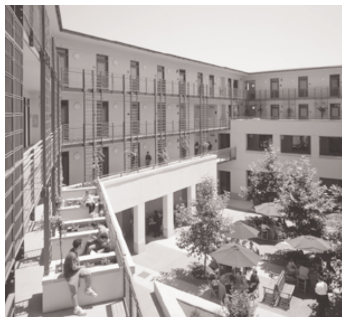
Figure 4. Both interior and exterior terraces overlook Bren Hall's courtyard.

Reclaimed water is piped from the local water utility to meet 100% of the site's landscape irrigation needs. The landscaping also features drought-tolerant native plants.